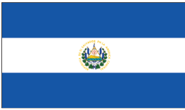
Fig. 22: Flag of El Salvador