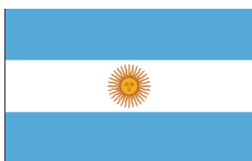
Fig. 8: Flag of Argentina