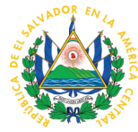
Fig. 23: Coat of arms of El Salvador