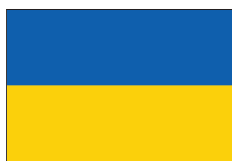
Fig. 1: Flag of Ukraine

In the arts, the first notion to understand the location of objects in space is given by the horizon. The best didactic example for this understanding can be seen in the Ukrainian flag, which shows an "imagined landscape" as a simplified picture (figure 1). The two-color version of this flag came in 1848, after the Congress of Lvov, based on the colors used in the former Austro-Hungarian region of Ruthenia and blue shield with golden lion used by the principality of Galicia-Volhynia in the region between the thirteenth and fourteenth centuries. It was with these colors – yellow upper and blue lower – the first national flag came in 1918, when the country gained brief independence. It was re-adopted in 1991, after the end of the Soviet rule, when the order of the colors was changed. In popular tradition, the blue stands for the sky, while the yellow band represent the vast fields of grains, especially wheat, growing in their territory and make the typical agricultural landscape of the country (figure 2). As a way of remembering the romantic tradition associated with the fields, nature and the rural life of its inhabitants, the agricultural landscape is also a way of creating unity around the cultural difference between ethnic Russians and Ukrainians living in the country.