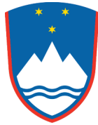
Fig. 17: Coat of arms of Slovenia