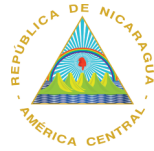
Fig. 25: Coat of arms of Nicaragua