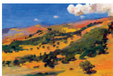
Fig. 7: Armenian landscape (1959) by Martiros Saryan