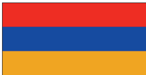
Fig. 5: Flag of Armenia