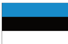
Fig. 3: Flag of Estonia

On the Baltic region, the tricolor used by Estonia, in blue, black and white, is also an association with aspects of nature (figure 3). It was introduced in 1881 at the time of the Russian imperial rule by Estonian students and was adopted after the country's independence (1920); after the period under Soviet rule (1945-1990) it reappeared as a national symbol. The blue stands for the sky, the water and fidelity; black is associated not only with the color of the soil, but also the past of suffering and oppression of Estonians; white is the color of snow and the desire for freedom. In turn, the colors