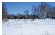
Fig.4: A winter landscape