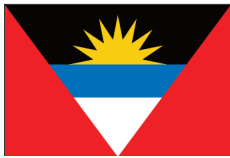
Fig. 10: Flag of Antigua and Barbuda