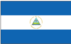
Fig. 24: Flag of Nicaragua