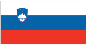
Fig. 16: Flag of Slovenia