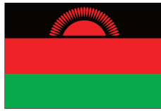
Fig. 11: Flag of Malawi