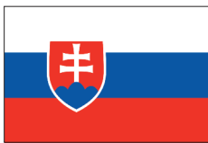
Fig. 14: Flag of Slovakia