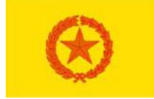
Orange—President of Indonesia