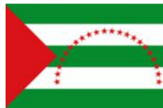
Manabí Province, Ecuador