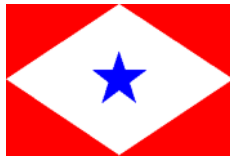
Cercle de la Voile de Paris, French sailing club