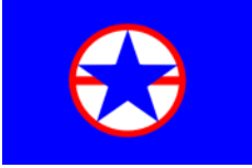
House flag of Metropolitan Shipping Ltd., Greek shipping company

Little information exists to suggest any specific symbolism to blue stars. Honduras and Panama are the only national flags featuring blue stars. However, blue stars appear on the flags of maritime-related organizations, such as shipping companies, and sailing and rowing clubs. Perhaps this suggests the blue symbolizes the water.