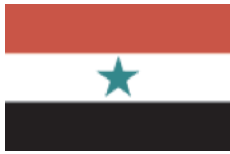
Yemen Arab Republic