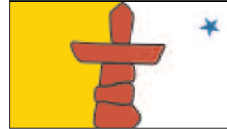
Nunavut, Canada. The blue color is for the wonders of earth, sea, and