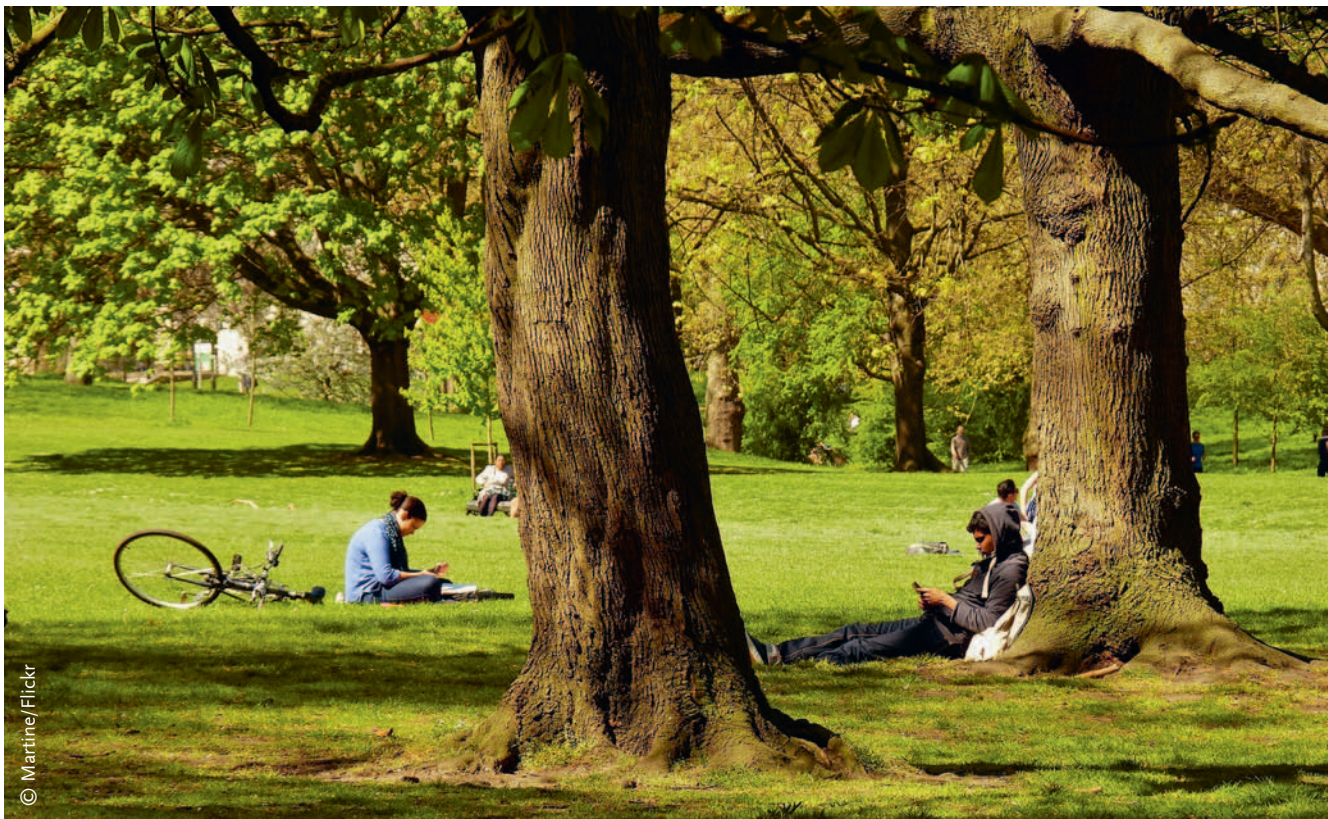
FIGURE 2: Nature-based solution approaches can promote the development and management of urban ecosystems to offer sustainable and cost-effective solutions to societal challenges like global warming, water regulation and human health, while enhancing biodiversity. Here, the Green Park in London.