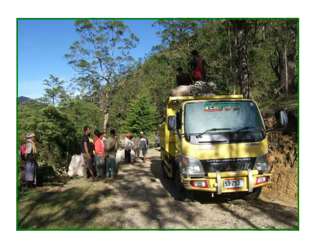
Getting to Hato Builico

Cooked meals are provided at guest houses in Hato Builico. There is a small shop open mornings and evenings, selling biscuits, noodles, tinned fish, sweets and beer. The market is held on Wednesday and Saturday mornings, with fresh bread rolls, seasonal local vegetables, some fruit and some grocery items, clothes and utensils if the trucks can get in.