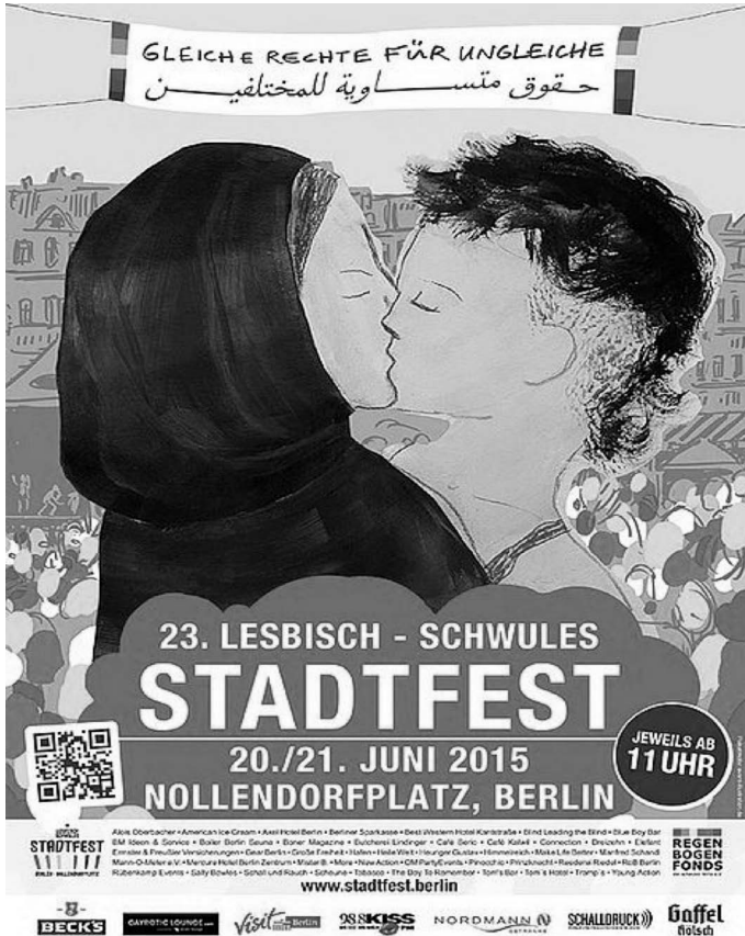
Illustration 1: A poster of the lesbian and gay city festival from the year 2015

“We assume that the Regenbogenfond’s intention, through the putatively more diverse representation of people on the poster, was to reach people and communities who so far were not – or only minimally – represented at the city festival. Had the aforementioned autonomous migrant organizations, groups and associations truly and meaningfully been able to participate in the planning (e.g. of the poster), the city festival might have actually, where possible, gained access to other communities” (MRBB 2015).