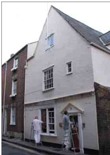
Greene's Tutorial College and registrar Jonathan Christie.

Located in Pembroke Street near Christ Church College in Oxford, the private tutorial college looks more like a traditional English house with fireplaces in almost every classroom.