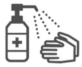
Keep clean using hand sanitizer

These contents are subject to change. For the latest information, please visit the Notice of the Individual Vaccination against COVID-19 page.