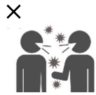
Avoid "3 Cs" Close-contact settings