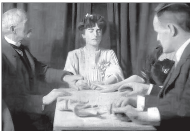
Photo 2. Charles Richet on the left during a séance.