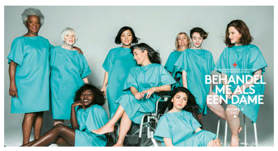
Figure 1 The campaign image from the 'Behandel me als een dame' campaign. woмеn Inc., KesselsKramer, photographer Bert Teunissen, 2016.

A similar case in point is the Dutch campaign that was launched in 2016 by the NGO Women Inc. to introduce a new national research agenda to investigate health disparities between women and men. The campaign image features the slogan "Treat me like a lady," and shows women of various ages and with various skin tones and hair types, one of them seated in a wheelchair, all dressed in green operation gowns (Figure 1).<sup>7</sup> Whereas such visual representation of diversity is laudable, this campaign does not actually address the importance of diversity other than sex and gender. As such, this image suggests that we are all women despite these differences, and thereby invites us to understand womanhood as a universal determinant of health that overrides or precedes any other health inequalities.