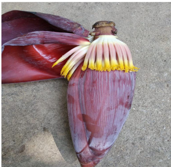
Fig. 3 Image depicting a 'koldil' from a market in Assam

ingredient in various food products [16]. The Bodo community which comprises of a large chunk of Assamese indigenous population also makes use of banana and its parts in their delicacies as well as for therapeutic reasons. The dietary habits of Bodos mostly depend on the local sources of variety of vegetables and non-vegetarian food items. The Bodo inhabitants of Baksa district of Assam are also well adapted with their natural surroundings and forest resources for their livelihood and they practise indigenous knowledge of ethnic food preparation. A study on the gut bacterial profile of these tribes