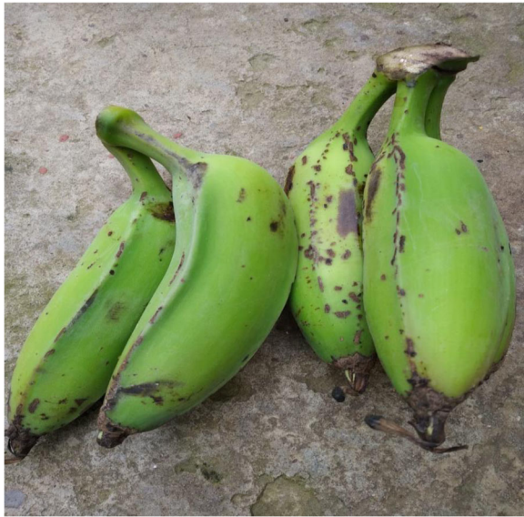
Fig. 2 Image showing 'Kaskol' from a market in Assam

ingredient in various food products [16]. The Bodo community which comprises of a large chunk of Assamese indigenous population also makes use of banana and its parts in their delicacies as well as for therapeutic reasons. The dietary habits of Bodos mostly depend on the local sources of variety of vegetables and non-vegetarian food items. The Bodo inhabitants of Baksa district of Assam are also well adapted with their natural surroundings and forest resources for their livelihood and they practise indigenous knowledge of ethnic food preparation. A study on the gut bacterial profile of these tribes