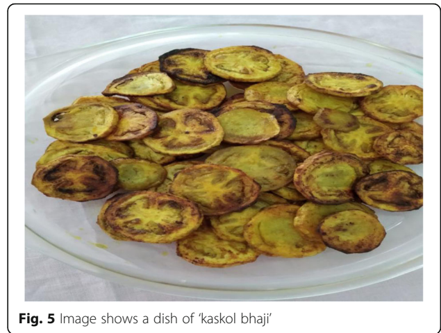
Fig. 5 Image shows a dish of 'kaskol bhaji'

curry is also made in a simple manner with limited spices. The most common form of curry is made by using a herb called 'skunk vine' which has a very strong odour and slightly bitter taste. It is usually served hot with rice.