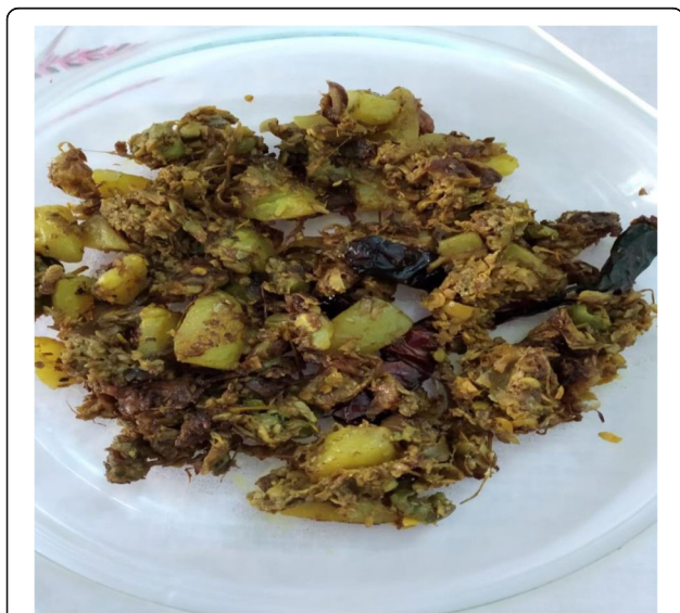
Fig. 4 Image shows a preparation of 'koldil bhaji'

One of the most savoured and authentic dishes used by Assamese people are kaskol dia mass (raw banana-based fish curry). Like most other Assamese delicacies, this