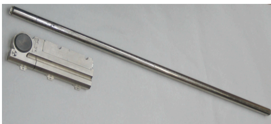
Figure 1: Block of DAN-PNG (below) and its industrial prototype ING 101 (above).

DAN instrumentation: The instrument contains two separate blocks of Pulsing Neutron Generator DAN-PNG (Figure 1) and of Detectors and Electronics DAN-DE (Figure 2) with the total mass of less than 5 kg.