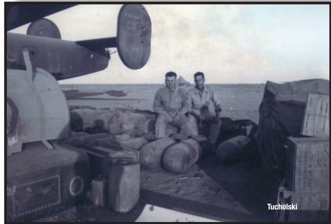
Berka 4, home base of the 389BG in Libya.

a radio message to Ninth AF, Cairo, for me. Two days later a reply came: “LEAVE PLANE. PROCEED TO MALTA.” Courtesy of the Royal Navy, we arrived in Malta midday on Saturday, July 17. Through a series of chance events, we found ourselves flying the 98th BG’s Daisy Mae back to their Bengasi base, on Sunday, July 18. From there we were trucked back to Berka 4. Two days later we began training for Operation Tidal Wave, which would be our mission #4.