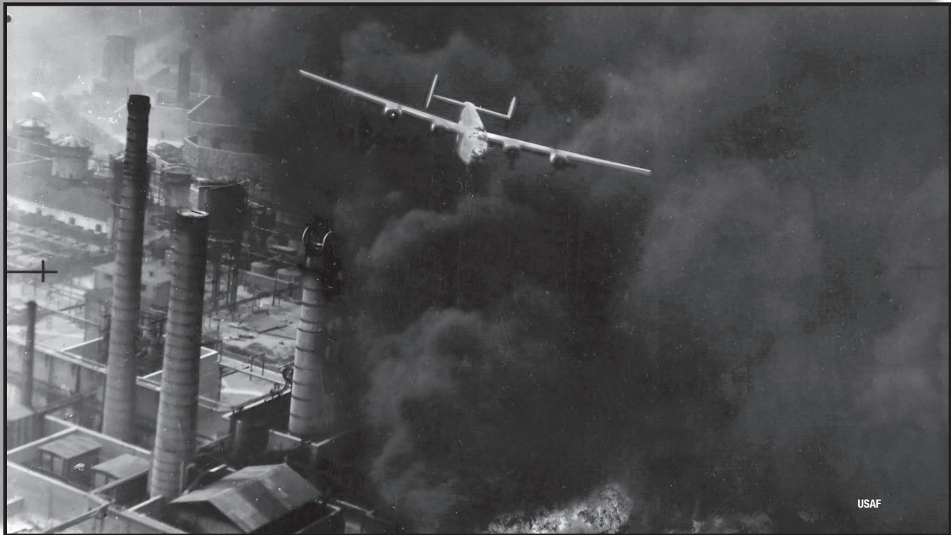
A 9th AF B-24 flies through the smoke and fire generated by bombs previously dropped by earlier aircraft.