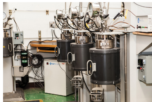
To better understand geologic formations, researchers at NETL's High-Pressure Immersion and Reactive Transport Laboratory in Albany are studying subsurface systems.