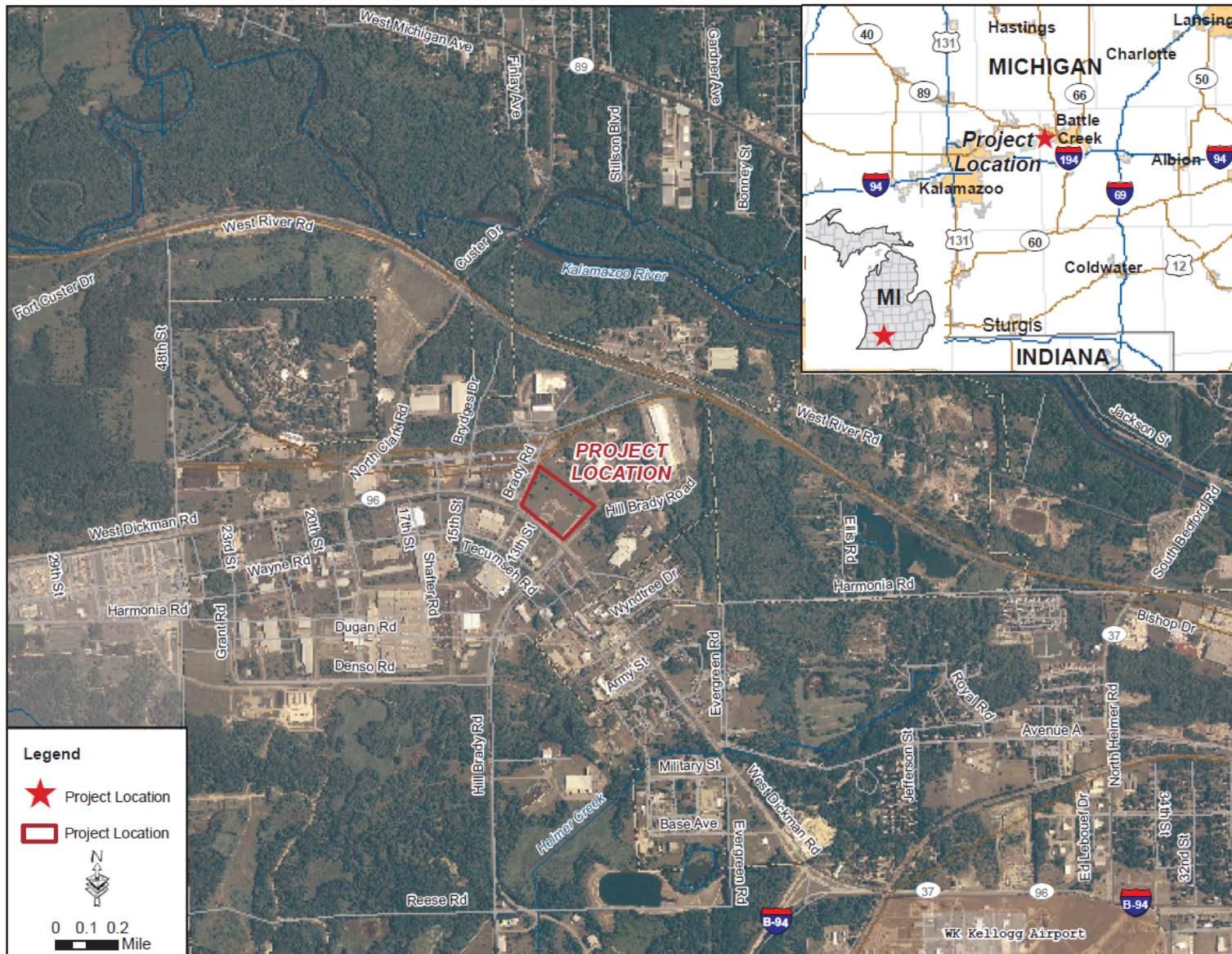
Figure 2.2-1. Regional Location Map