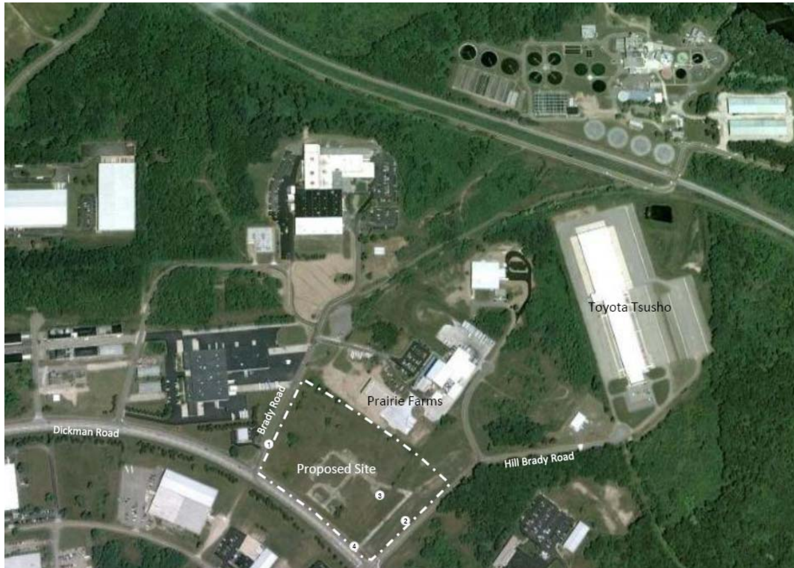
Figure 2.2-2. Site Location Map