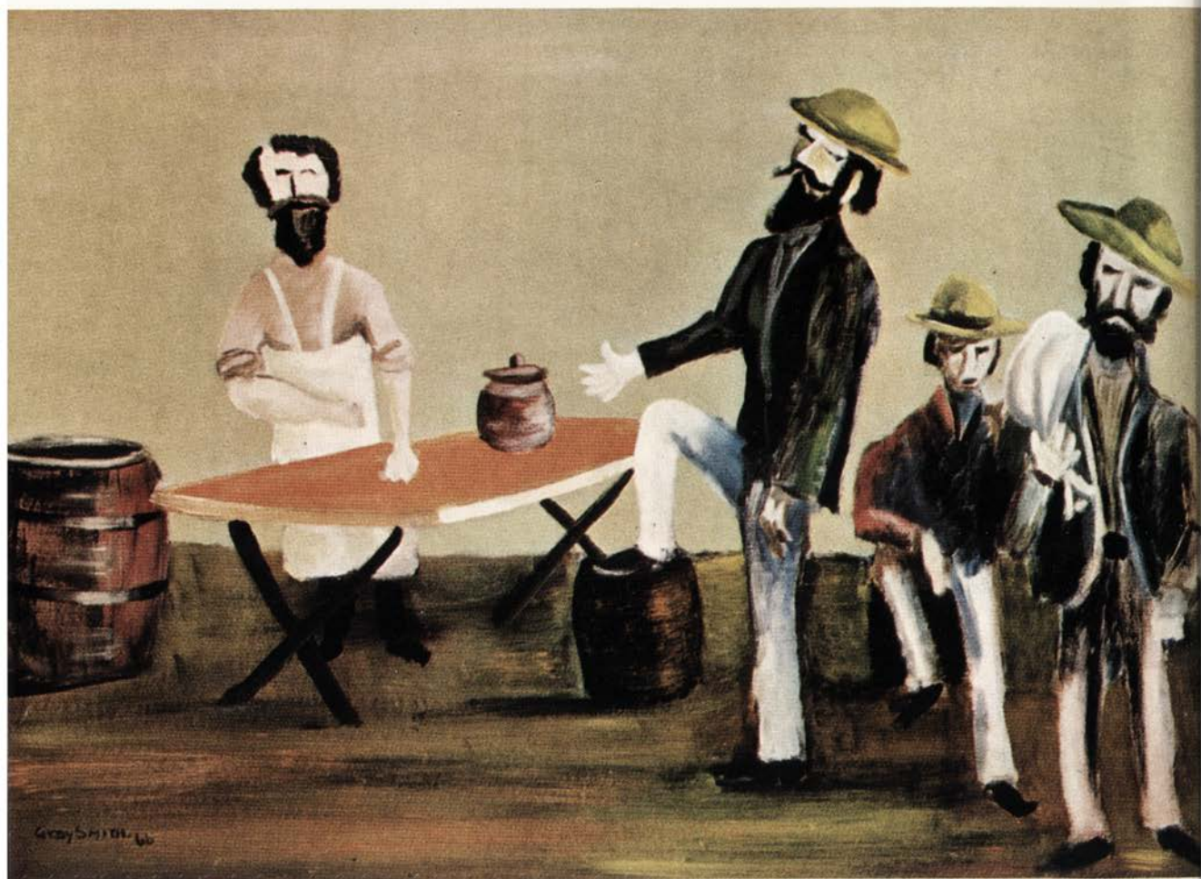
Shepherds lining up for rations: 10 lb. flour, 10 lb. meat, 2 lb. sugar, \frac{1}{4} lb. tea. In 1856 Richard Shumack, as a station hand, received 15 lb. each of meat and flour, 3 lb. sugar, \frac{1}{2} lb. tea and 5 oz. salt