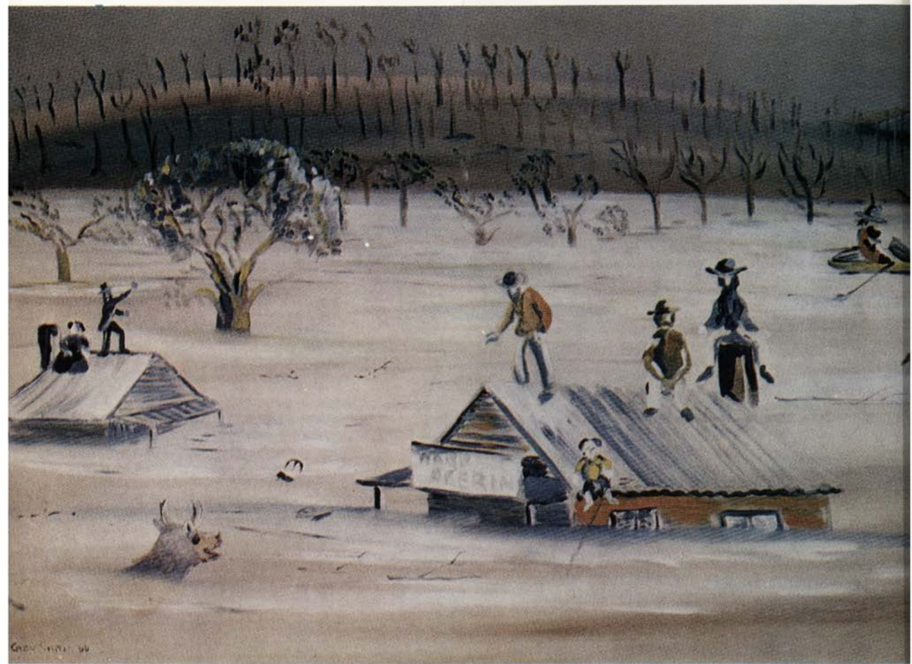
The great flood of 1870, when the Qucanbeyan River burst its banks and flooded 'The Harp of Erin'