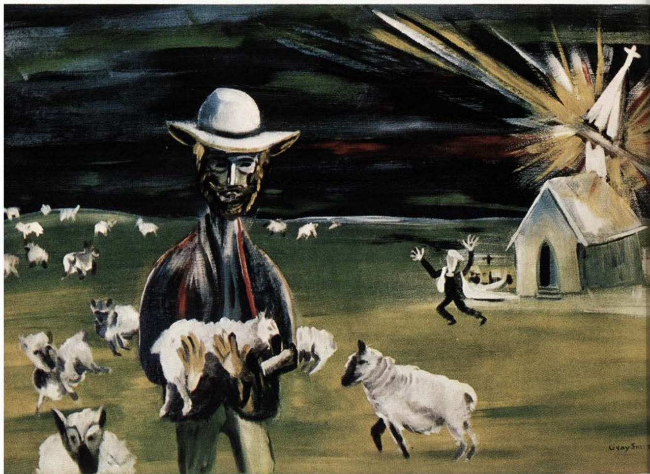
The tower of St John's Church, Canberra, struck by lightning in 1851