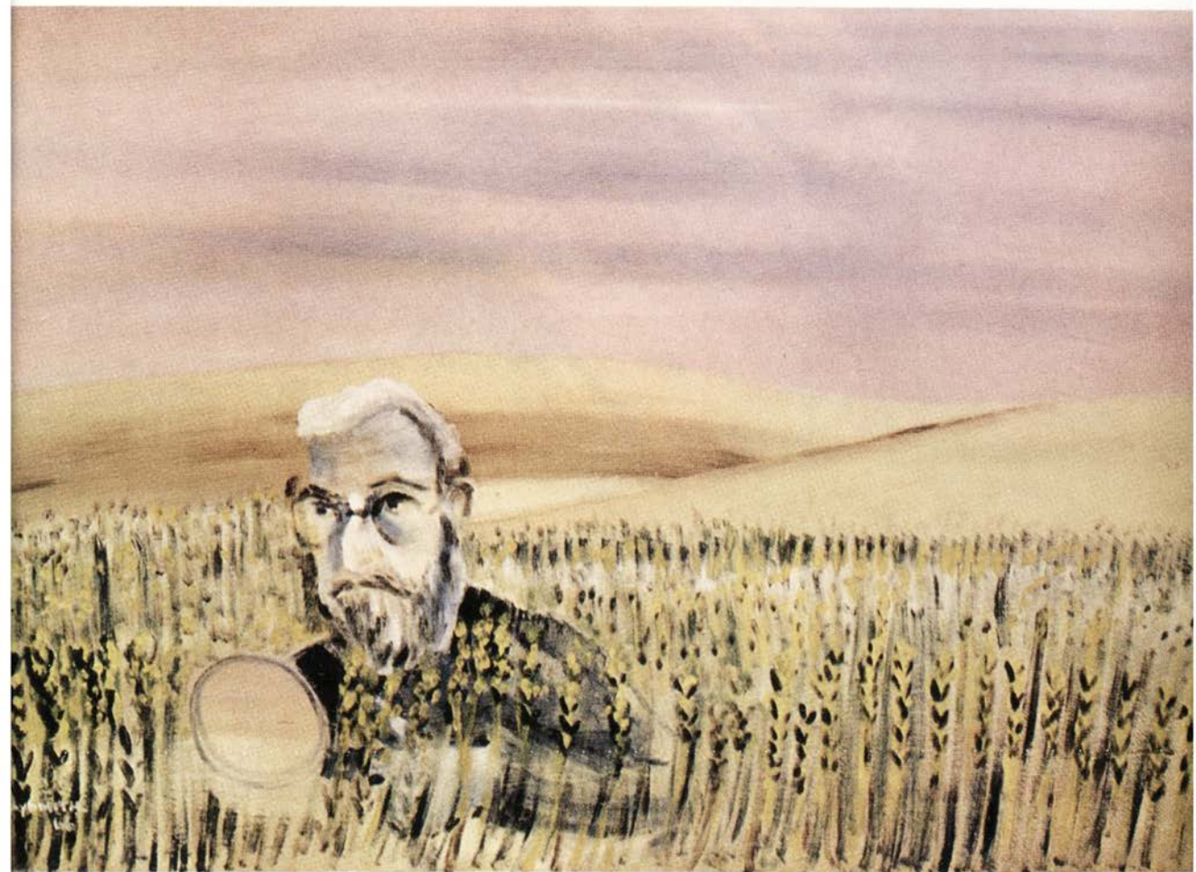
William Farrer, whose experiments finally resulted in rust-resistant wheat