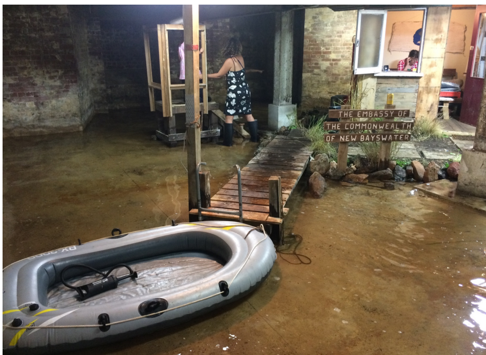
Figure 3 – The Embassy's dingy, jetty and office (with visitors – image central left)

area. Located on coastal land reclaimed in the mid 1800s, the basements of Fremantle's Victorian buildings have become increasingly prone to flooding. At present, most buildings in West End with basements are either flooded with water of variable depth, dependent on tide cycles, or else drained by pumps. The Princess Chambers building is an example of the former. Entering the embassy via descending stairs to a large, open basement, visitors were met by a water-covered floor space, with a small built island at the opposite end of the room. Access to the island, upon which the Embassy was located, was aided by both the provision of rubber boots that visitors could don to wade across, or by a small dingy, moored at a quay projecting from the island (Figure 3).