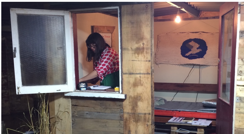
Figure 4 – Embassy office in operation (visa applications on table visible through the open door) (author’s photo, 2017)

WA”. 11 Johns has clarified the latter by explaining that the referent island is an actual location in South West WA whose location was deliberately not identified and that installations such as the Fremantle Embassy form temporary annexes to the core territorial entity (pc 16th November 2017).