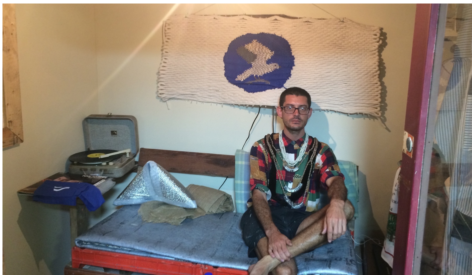
Figure 5 – Ambassador (and artist) Jesse Lee Johns at the Embassy (wearing official uniform and regalia) (author’s photo 2017)