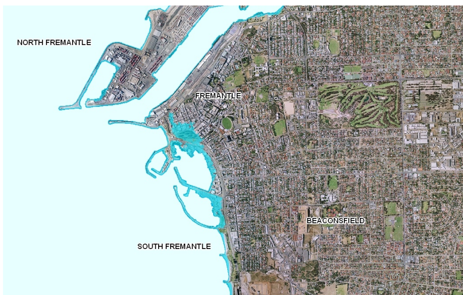
Figure 2 – Map of the impact of projected rise in sea level of one metre on Fremantle by 2100, existing sea levels in light blue, projected encroachments onto land in turquoise (City of Fremantle, 2012: 6 10 ).