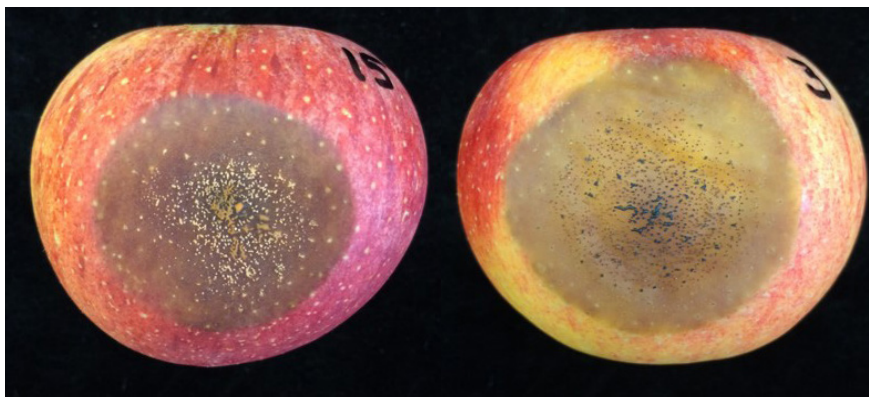
FIGURE 5. DIFFERENCES IN APPEARANCE BETWEEN COMPLEXES CAN OFTEN BE OBSERVED BY SPORULATION PATTERNS. SPECIES WITHIN THE C. ACUTATUM COMPLEX PRODUCE ORANGE CONIDIAL (SPORE) MASSES DURING WET CONDITIONS (LEFT), WHILE C. GLOEOSPORIODES COMPLEX SPECIES DEVELOP BLACK ACERVULI (FRUITING STRUCTURES) AND NO ORANGE CONIDIAL MASSES (RIGHT).

When weather warms, fungi produce fruiting structures (acervuli) on the surface of plant tissues. During wet conditions, these structures absorb water and release infective spores (conidia). Some species