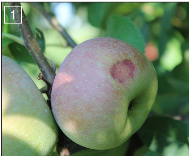
FIGURE 1. THE FIRST SYMPTOMS OF BITTER ROT ARE SMALL TO MEDIUM-SIZED, SLIGHTLY SUNKEN LESIONS.

Bitter rot is a fungal disease caused by multiple species within the Colletotrichum acutatum and Colletotrichum gloeosporioides sp. complexes (FIGURE 5). Each complex contains 34 and 38