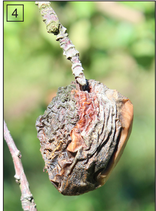
FIGURE 4. INFECTED FRUIT MAY REMAIN ATTACHED TO TREES AS MUMMIES AND SERVE AS INOCULUM SOURCES FOR SUBSEQUENT SEASONS.

individual species, respectively. Previous literature (and some current publications) reference species complex instead of the specific species within the complex. To date, 12 individual species of Colletotrichum have been identified as fruit rot pathogens in the Southeastern U.S. (TABLE 1). In Kentucky, six individual species are known to cause apple bitter rot. Species identification is important because individual species exhibit differences in: