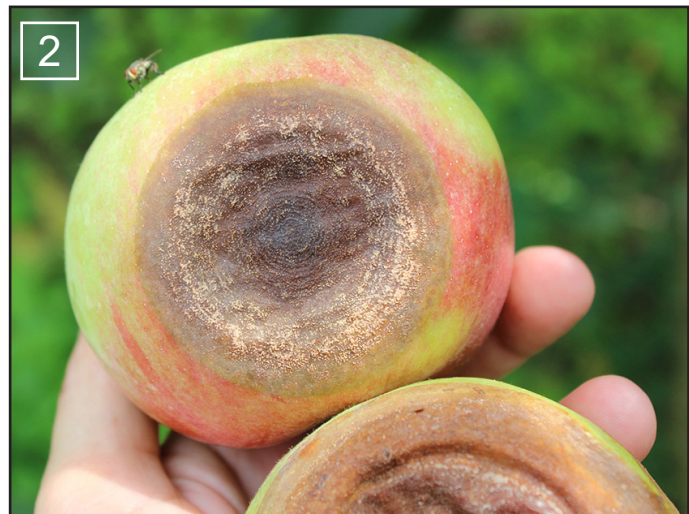
FIGURE 2. SUNKEN LESIONS WITH BULL’S-EYE APPEARANCE ARE TYPICAL OF LATE-SEASON SYMPTOMS OF BITTER ROT.