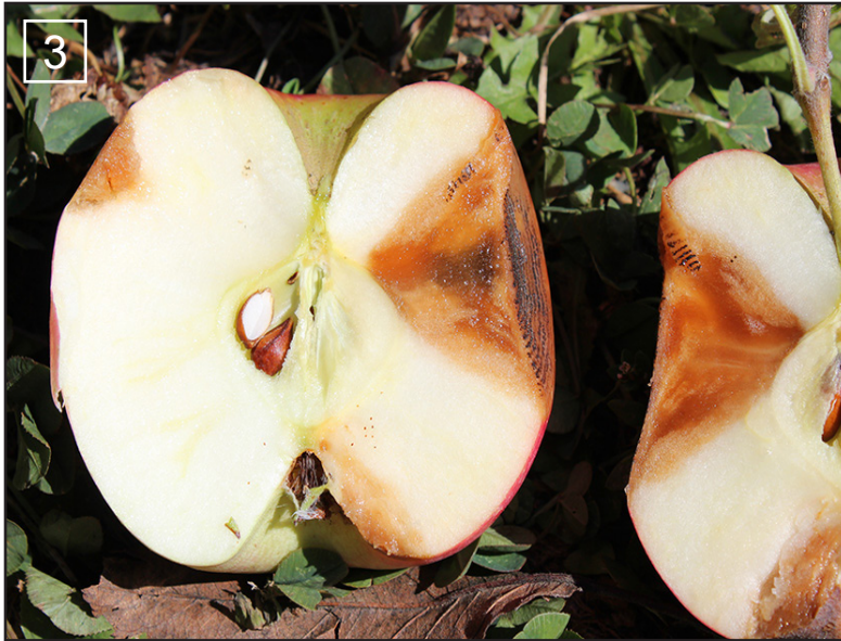
FIGURE 3. INTERNAL V-SHAPED ROT IS AN IDENTIFYING CHARACTERISTIC OF BITTER ROT.