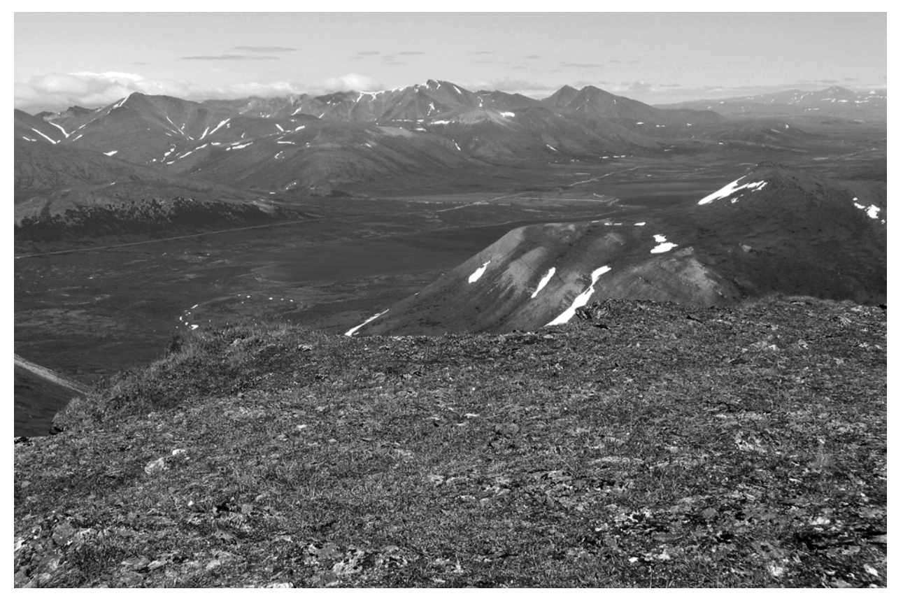
View of Salmon Lake and the eastern Kigluaik Mountains, central Seward Peninsula

Pamphlet to accompany Scientific Investigations Map 3131