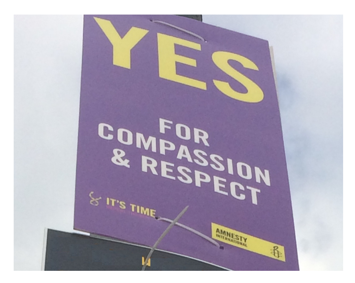
Figure 4: Campaign poster by Amnesty International.