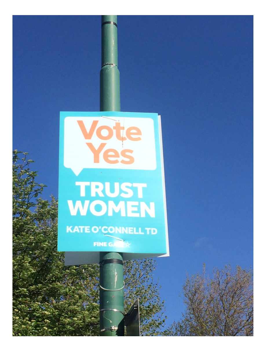
Figure 3: Campaign poster by public representative, Kate O'Connell.