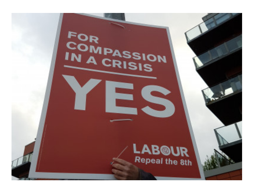
Figure 5: Campaign poster by the Irish Labor Party.