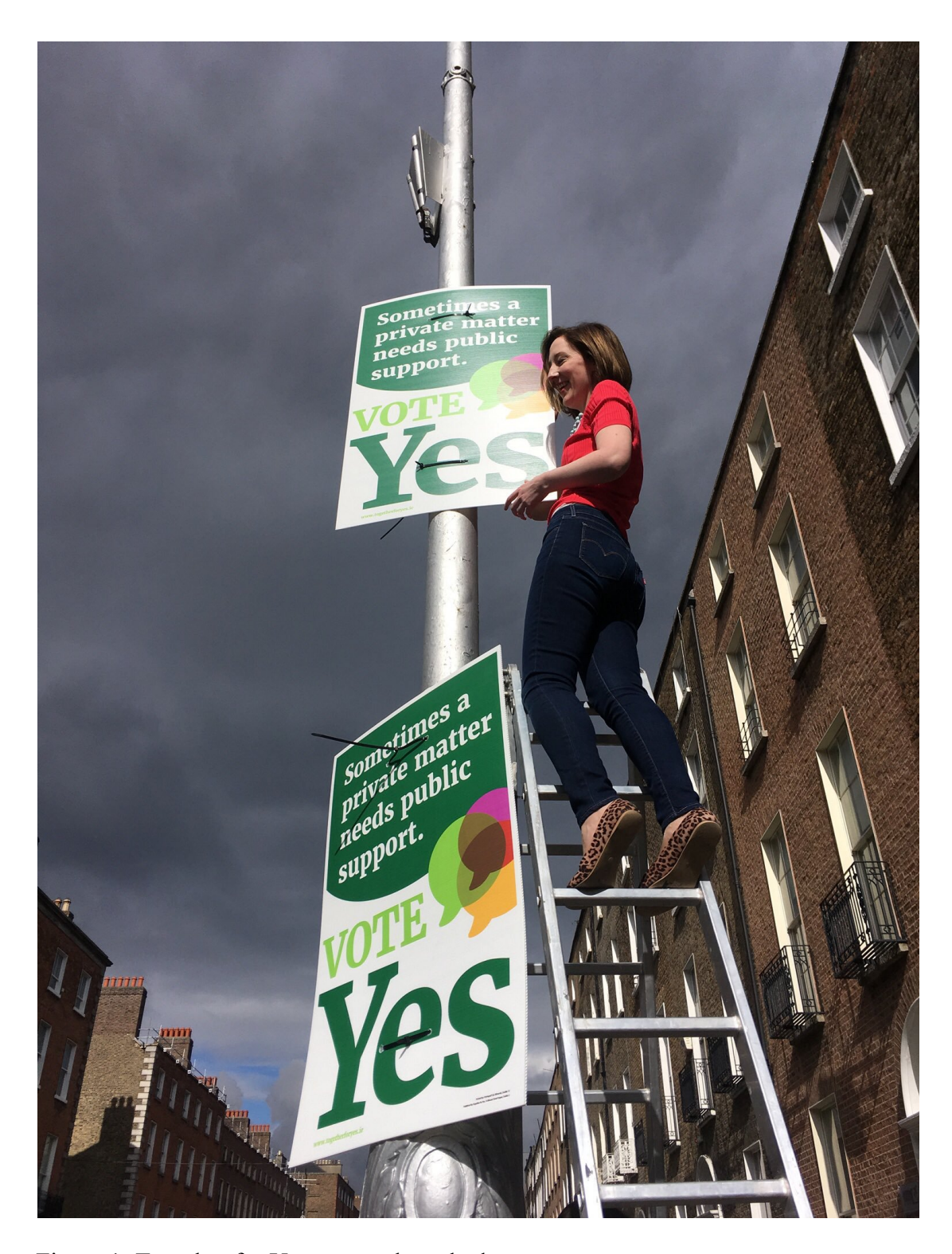
Figure 1: Together for Yes posters launched.