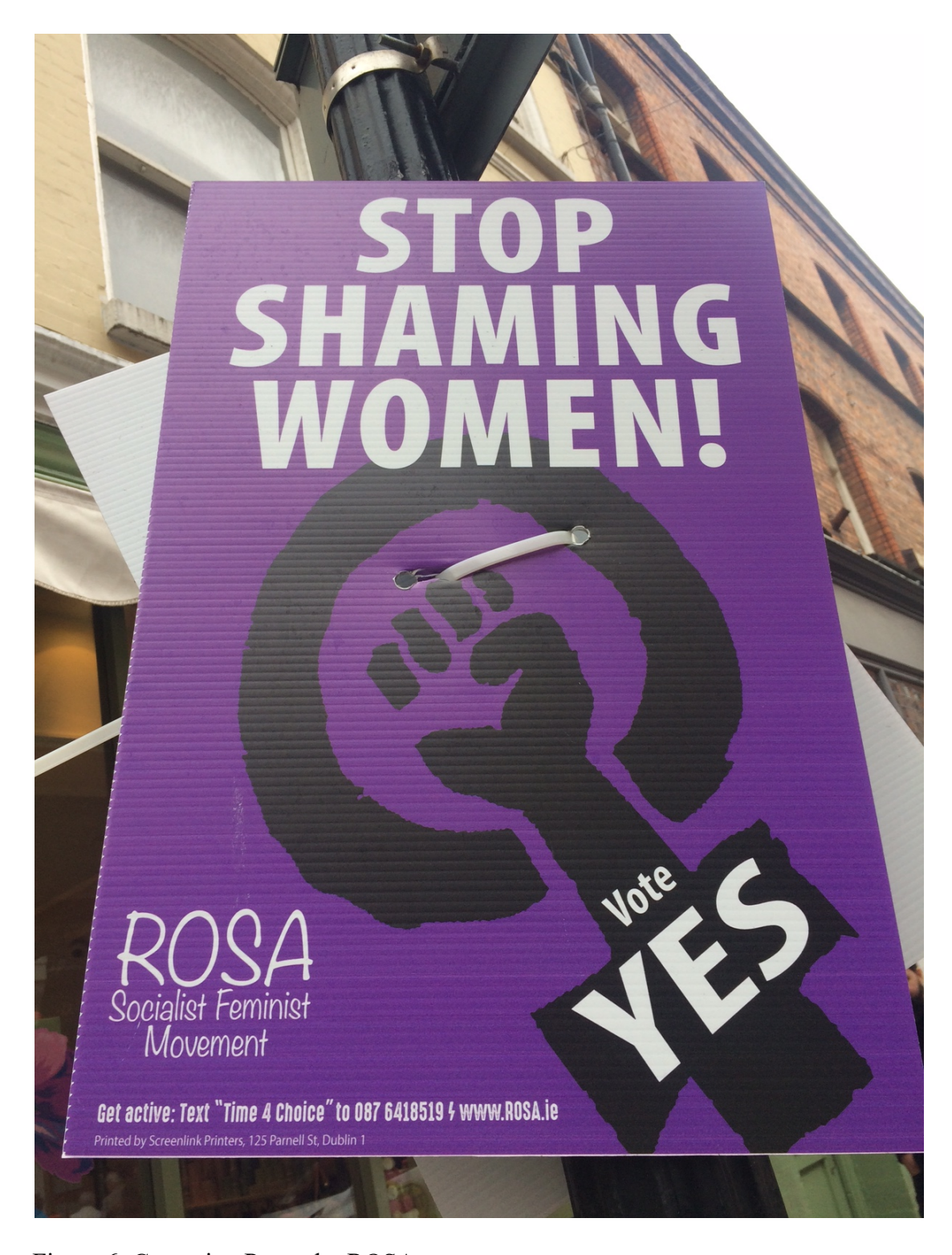
Figure 6: Campaign Poster by ROSA.