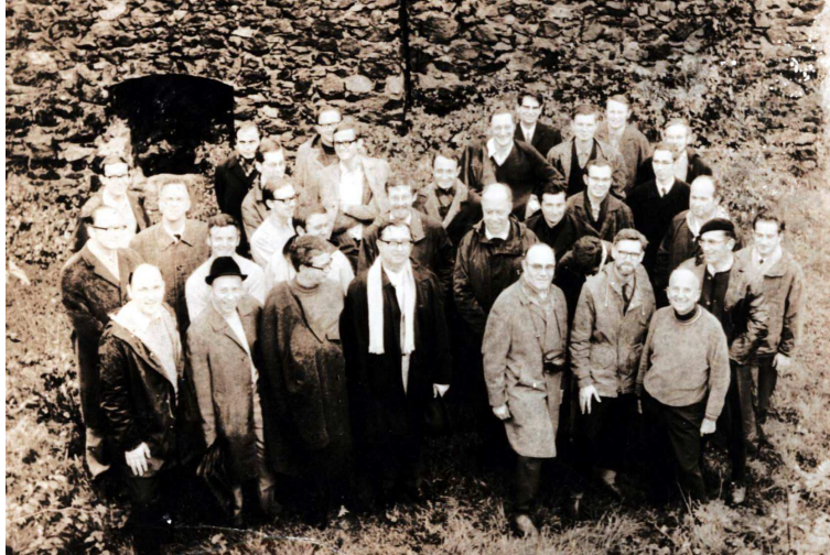
Figure 6: A 1970 hike around Oberwolfach