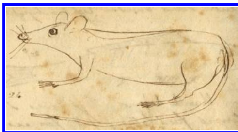
Figure 6. “Blackish rat Musculus niger ”, Musculus nigricans (no. 224). “Entirely blackish, belly gray, tail longer than the body and black. Length 6 inches. Common name, black rat or wood rat, lives in woods on seeds and nuts” (Rafinesque 1818b: 446). Original image 69 × 36 mm.