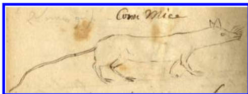
Figure 5. “Black-eared shrew,” Sorex melanotis (no. 194). “Body pale gray, white beneath, ears erect, black outside, white inside, neck and body elongated, tail nearly as long, gray. Length 5 inches. Vulgar name, corn mice” (Rafinesque 1818b: 446). Original image 83 × 24 mm.