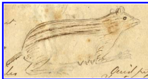
Figure 7. “White-striped lemming”, Lemmus albovittatus (no. 192). “Fallow, with 5 white longitudinal stripes, the middle one extending over the head to the nose, tail truncate, one-sixth of total length. Length 4 inches. A most interesting small animal; vulgar name, nursing mouse. The female carries her young on her back, she has 6 pectoral teats; she lives on corn, seeds, &c” (Rafinesque 1818b: 446). Formally described as L. albovittatus , Rafinesque (1818b: 106; 1820a: 3) subsequently referred to it as L. vittatus . Original image 57 × 29 mm.

All images pen-over-pencil sketches from Rafinesque's field notebook 17.