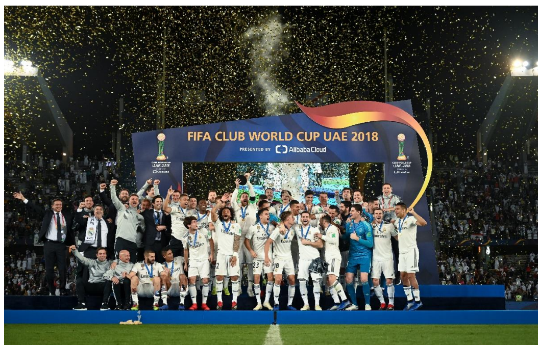
Real Madrid CF lift the trophy after winning the FIFA World Club Cup 2018 final against Al Ain in Abu Dhabi, United Arab Emirates.