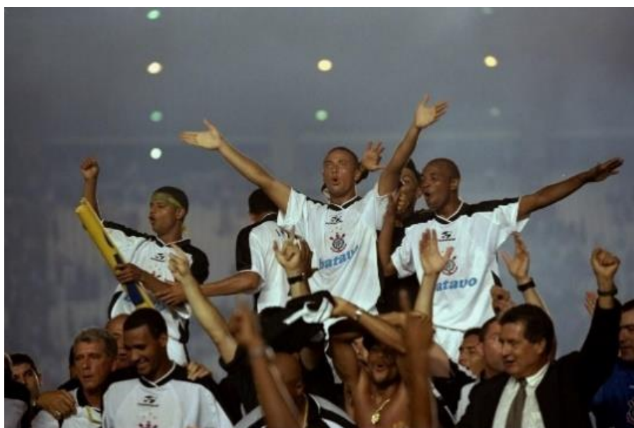
Corinthians (BRA) celebrate victory over Vasco da Gama (BRA) at the FIFA Club World Cup 2000 in Rio de Janeiro.