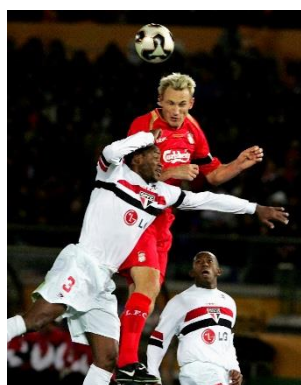
Sami Hyypia of Liverpool and Fabao of Sao Paulo FC in action during the FIFA Club World Championship Toyota Cup 2005 at the Yokohama International Stadium in Yokohama, Japan.