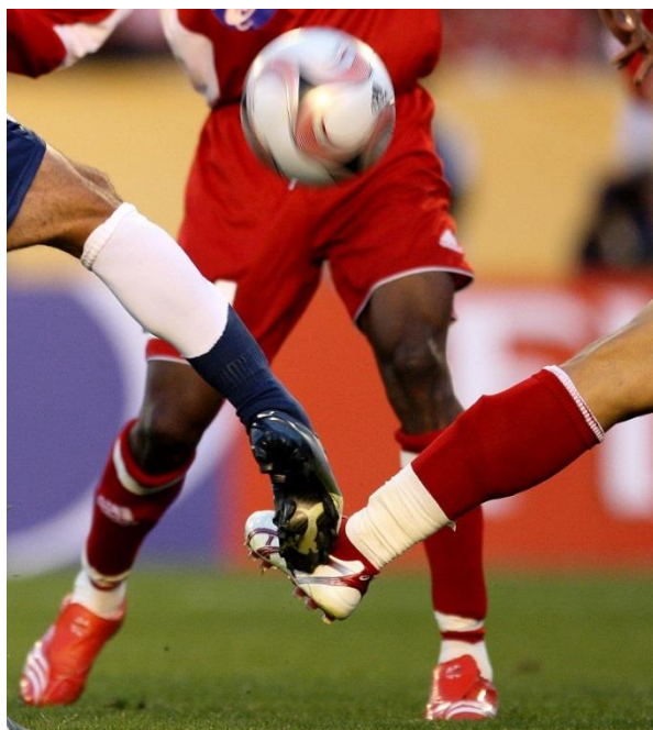
Scene from the match Etoile Sportive du Sahel (TUN) vs Pachuca (MEX) in 2007, Tokyo Japan

As from 2007 the host's top team has also participated. In 2007, as a Japanese team won the AFC Champions League, the highest placed non-Japanese team of the AFC Champions League had a play-off for the quarter-finals with the OFC representative.