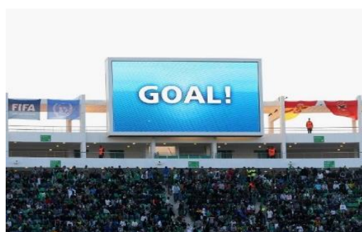
The big screen display during the FIFA Club World Cup quarter-final match between Guangzhou Evergrande FC and Al-Ahly SC at the Agadir Stadium in Agadir, Morocco in 2013.