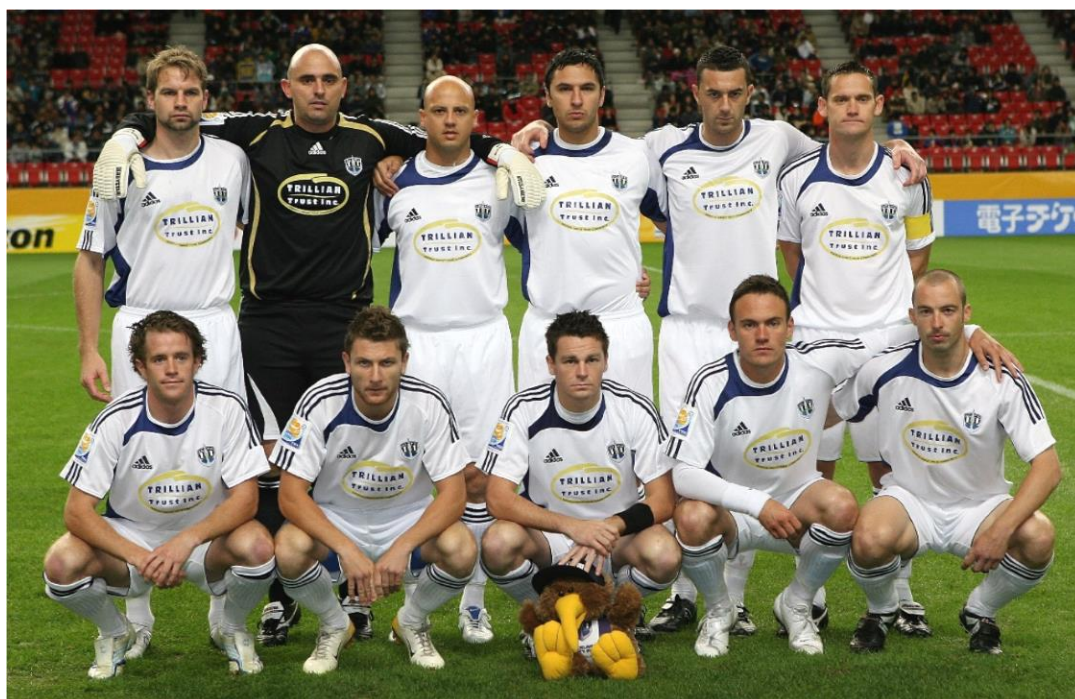
Auckland City FC line-up before the FIFA Club World Cup 2006 quarter-finals against Ahly Sporting Club at the Toyota Stadium in Toyota, Japan.