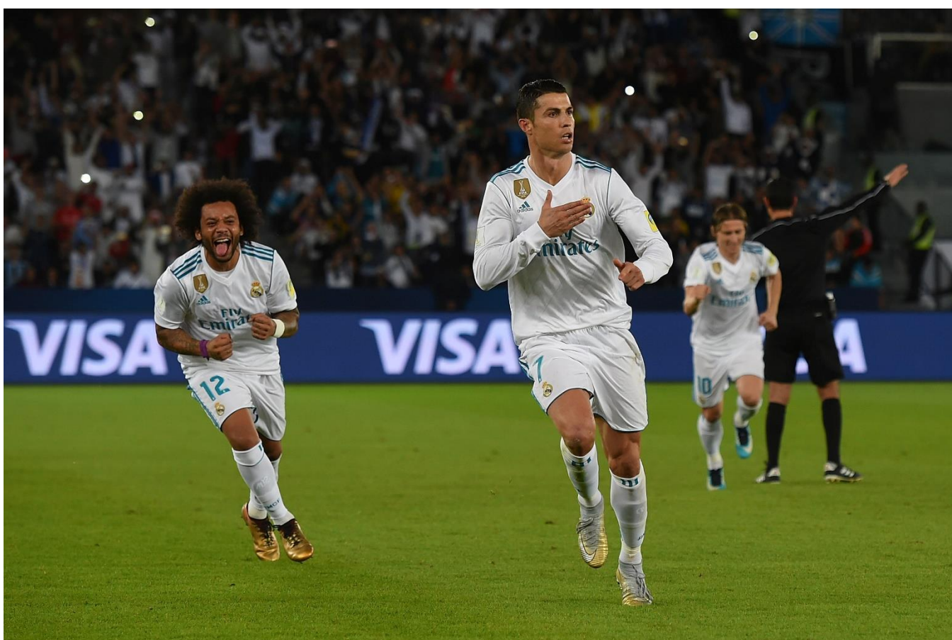
Cristiano Ronaldo celebrates scoring during the FIFA Club World Cup UAE 2017 final match against Gremio in Abu Dhabi, United Arab Emirates.