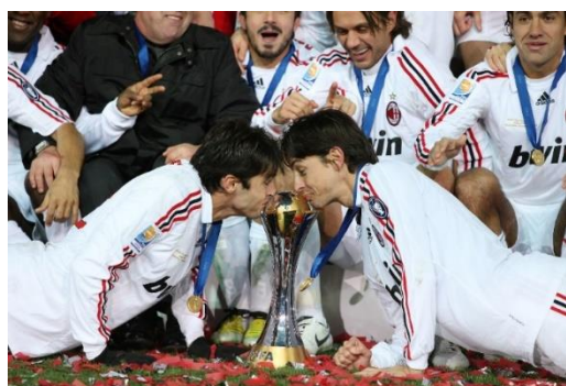
Kaka (left) and Filippo Inzaghi celebrating AC Milan's (ITA) victory over Boca Juniors (ARG) in the FIFA Club World Cup 2007 final in Yokohama, Japan