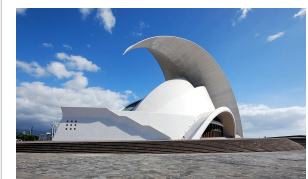
Auditorio de Tenerife in Santa Cruz de Tenerife by Santiago Calatrava. Completed 2003.