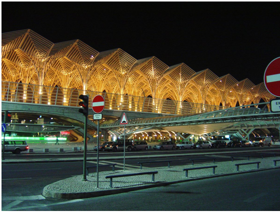
Gare do Oriente (Lisbon, Portugal), designed by the Spanish architect Santiago Calatrava.

Some of the best-known and influential architects in the Postmodern style are: