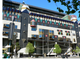
RMIT Building 8, Swanston Street in Melbourne by Edmund & Corrigan, 1993.