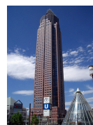
Meseturm in Frankfurt, Germany by Helmut Jahn. Completed 1991.