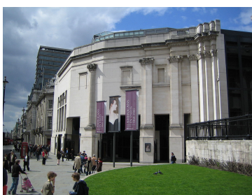
Sainsbury Wing of the National Gallery in London by Robert Venturi (1991).