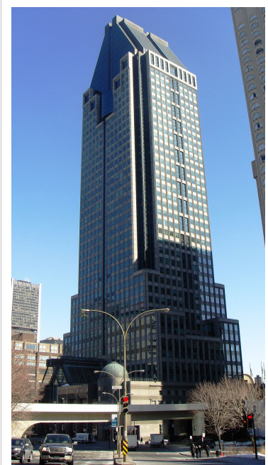
1000 de La Gauchetière, in Montréal, with ornamented and strongly defined top, middle and bottom. Contrast with the modernist Seagram Building.