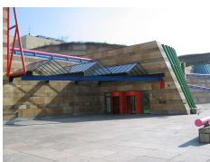
Neue Staatsgalerie in Stuttgart, Germany by James Stirling and Michael Wilford, 1984.