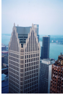
One Detroit Center in Detroit by John Burgee and Philip Johnson, completed 1993.