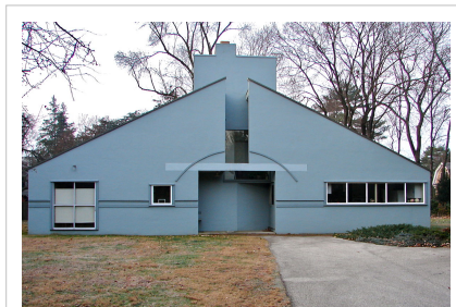
Vanna Venturi House with its split gable.

Architects can bemoan or try to ignore them (referring to the ornamental and decorative elements in buildings) or even try to abolish them, but they will not go away. Or they will not go away for a long time, because architects do not have the power to replace them (nor do they know what to replace them with).