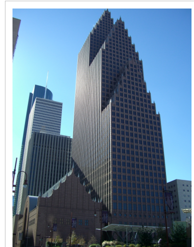
Bank of America Center in Houston by John Burgee and Philip Johnson. It combines architecture elements of pre-WWII skyscrapers with elements of modern aesthetics.