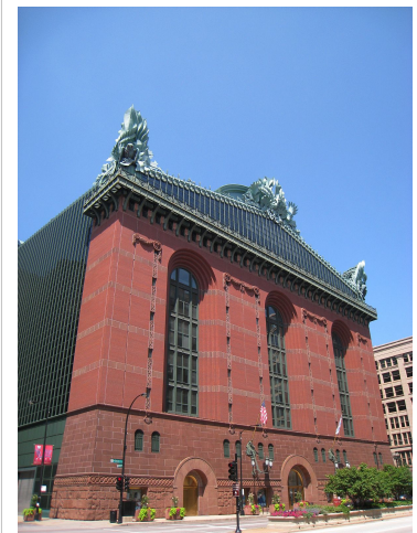
The Harold Washington Library was modeled on nearby buildings of Chicago's downtown.

One building form that typifies the explorations of Postmodernism is the traditional gable roof, in place of the iconic flat roof of modernism. Shedding water away from the center of the building, such a roof form always served a