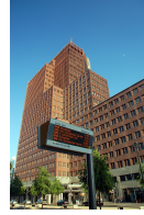
Kollhoff-Tower [4] at Potsdamer Platz in Berlin by Hans Kollhoff. Completed 1999.