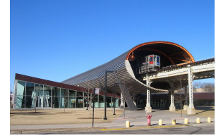
The McCormick Tribune Campus Center at Chicago's IIT Campus by Rem Koolhaas, 2003.