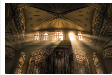
The interior of the Basilica of Our Lady of Licheń clearly draws from classical forms of Western European church architecture.

Postmodernism has its origins in the perceived failure of Modern Architecture. Its preoccupation with functionalism and economical building meant that ornaments were done away with and the buildings were cloaked in a stark rational appearance. Many felt the buildings failed to meet the human need for comfort both for body and for the eye, that modernism did not account for the desire for beauty. The problem worsened when some already monotonous apartment blocks degenerated into slums. In response, architects sought to reintroduce ornament, color, decoration and human scale to buildings. Form was no longer to be defined solely by its functional requirements or minimal appearance.