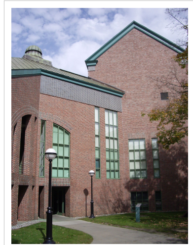
Hood Museum of Art at the campus of Dartmouth College in Hanover, New Hampshire (1983).

The characteristics of Postmodernism were rather unified given their diverse appearances. The most notable among their characteristics is their playfully extravagant forms and the humour of the meanings the buildings conveyed.