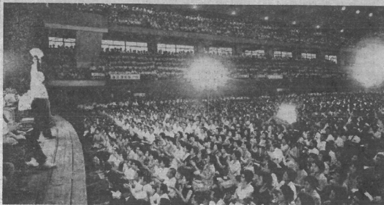
Religion der Massen — ekstatischer Redner bei einem Sokagakkei-Meeting

der Religion gestanden sei, frage ich ihn? „Als Student war ich Christ. Aber ich hatte große Schwierigkeiten. Ich hätte Thee und wann immer ich vor Men-