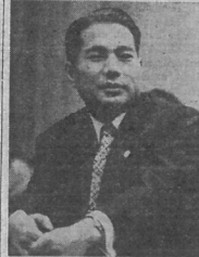
Der „Führer“ — energischer Präsident Daisaku Ikeda

Beton, Architektur von heute mit antistichischen Elementen — das ist das Hauptquartier, nicht weit von einer der großen Bahnstationen, die Tokios Menschenzirkulation regulieren. Bevor ich in das Sprechzimmer geführt werde, muß ich die Schuhe ausziehen. Zwei höfliche junge Herren mit kreisrunden Abzeichen am Rückaufschlag empfangen mich. Sie gehören zur Public-Relations-Abteilung. Der jüngere ist Redakteur der englischsprachigen Zeitung. (Das japanische Sokagakkei-Blatt hat eine Auflage von 2,5 Millionen.) Wie er zu