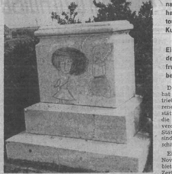
Grabstein als Tafel für Zeichenübung. Die Lebenden wurden vertrieben, die Toten sind rechts