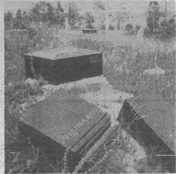
Keine Ruhe für die Toten — aufgebrochene Gräber, geschleht leben in einem einst deutschen Friedhof in

ARI hat ein neues großes Herrenkleiderhaus im Herzen Wiens eröffnet VIII, Lerchenfelder Straße 162, Ecke Blindengasse - verlängerte Kaiserstraße (früher Horak)