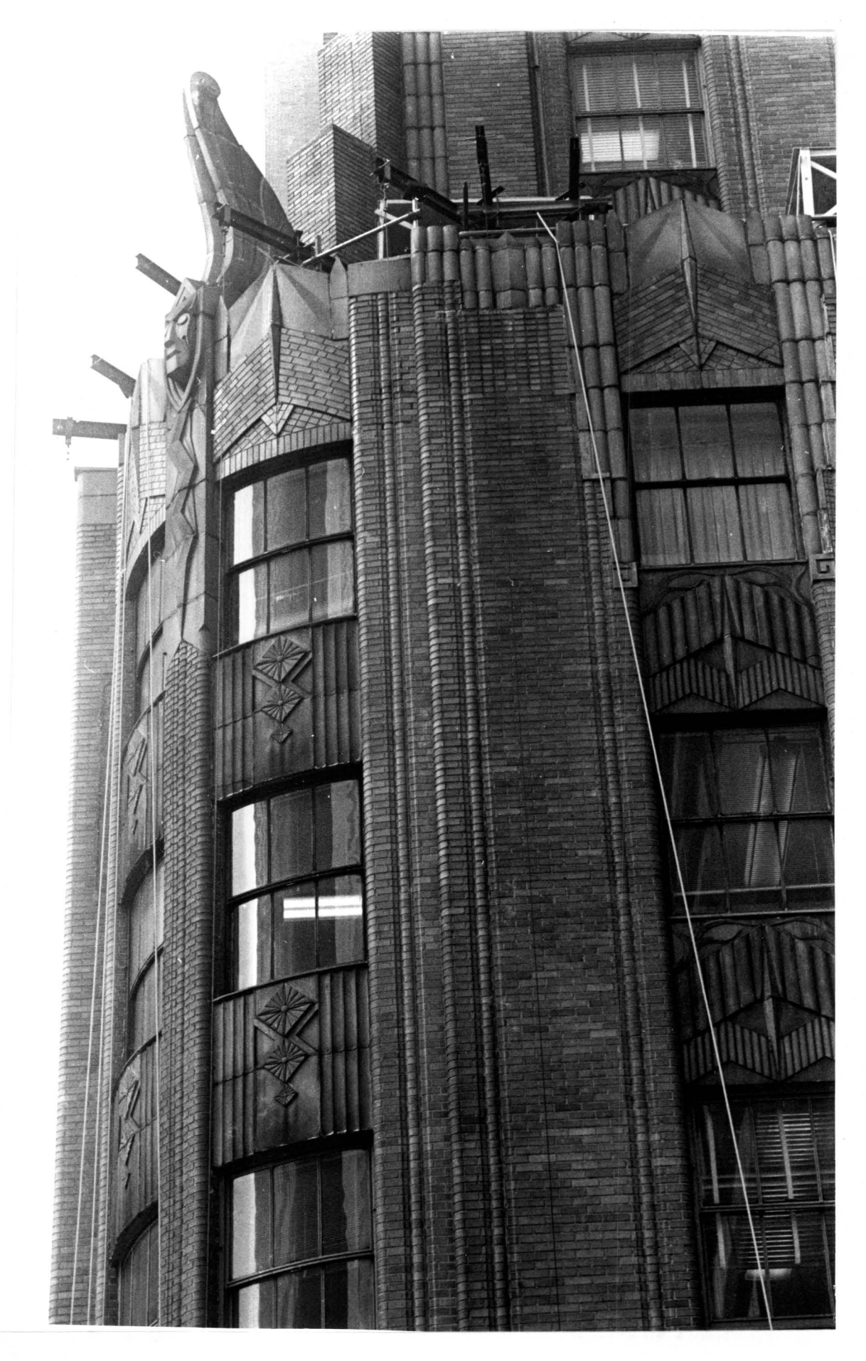
General Electric Building window detail