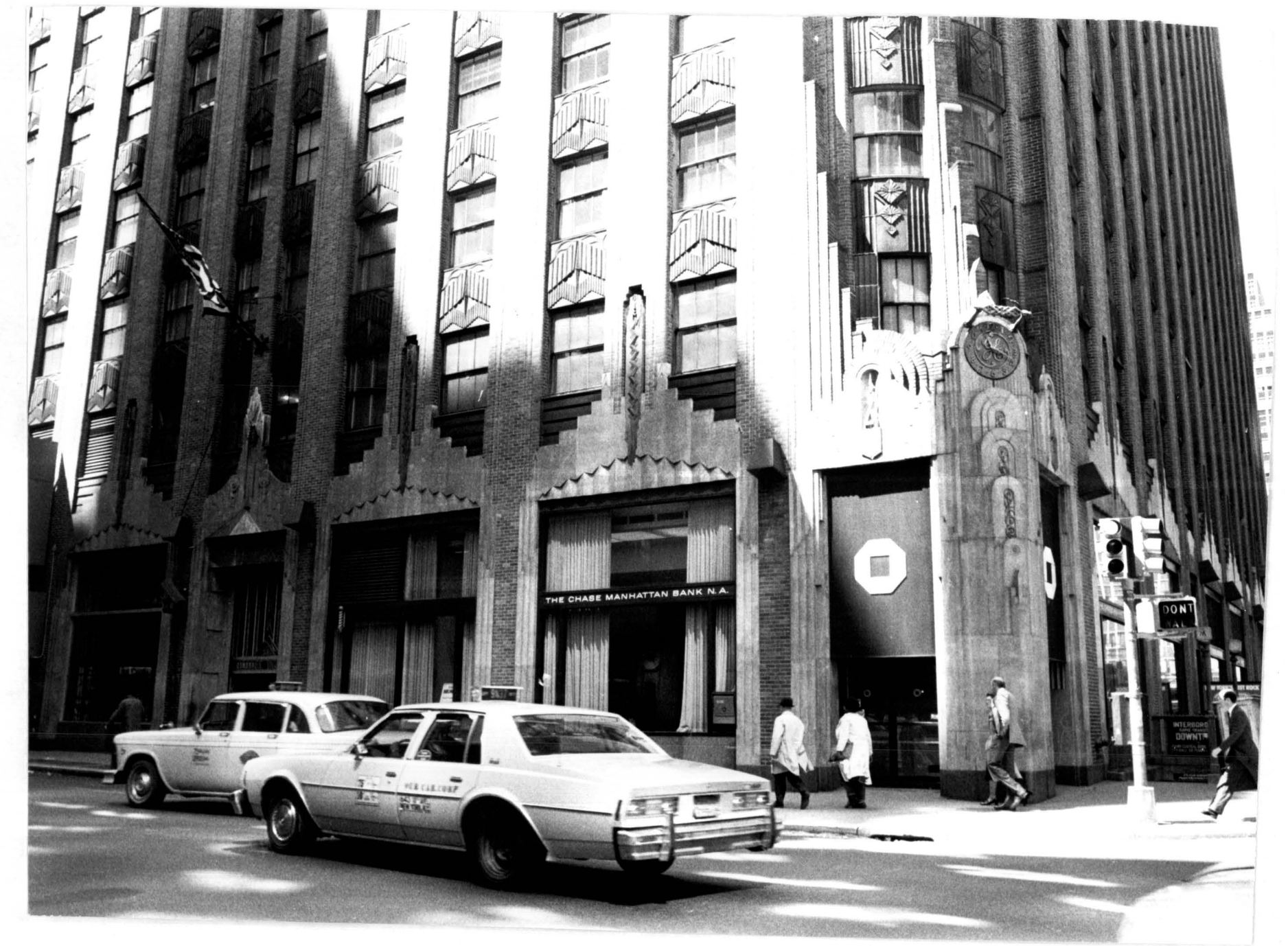
General Electric Building ground floor detail