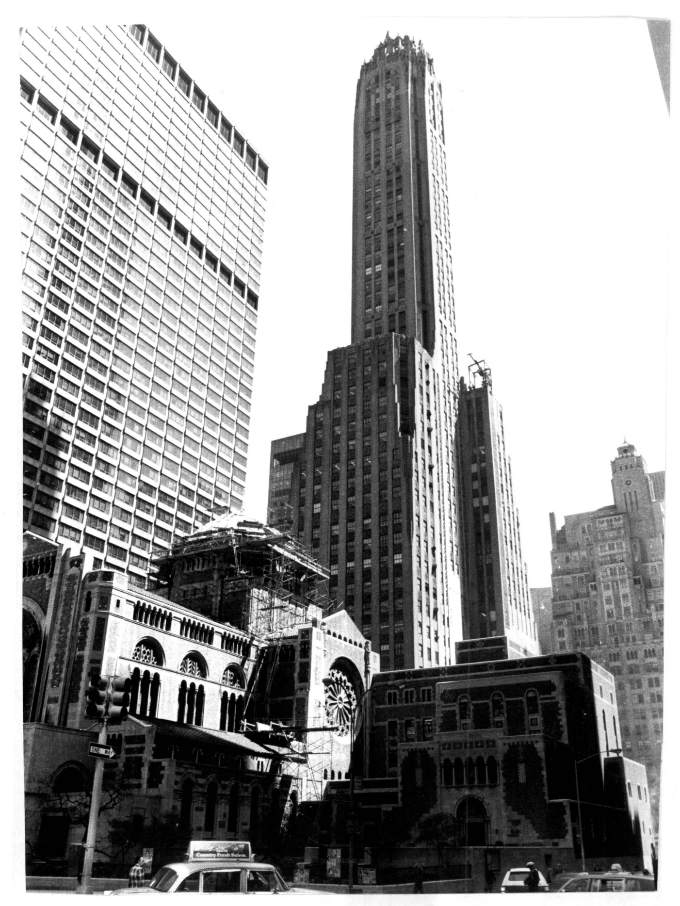
General Electric Building (originally RCA Building) 570 Lexington Avenue Manhattan