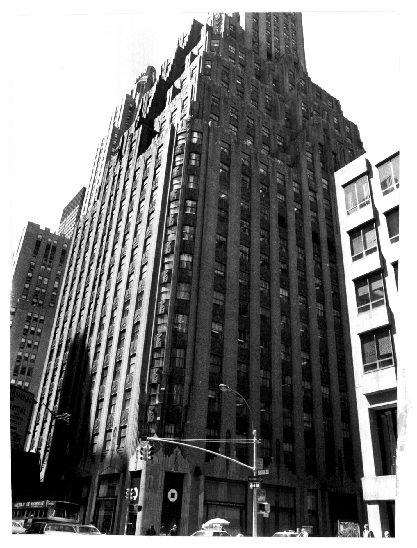
General Electric Building (originally RCA Building) 570 Lexington Avenue Manhattan