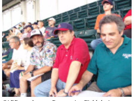
SABR members at Progressive Field during SABR 38

About 20 to 25 percent of the SABR membership participates in a research committee.