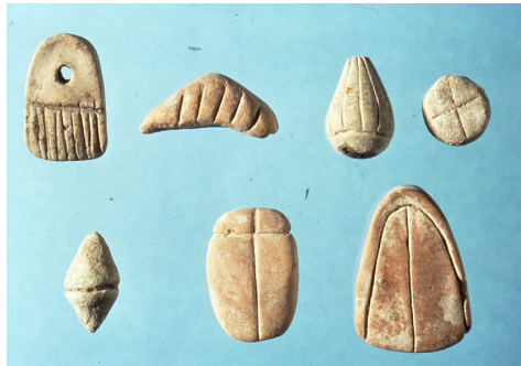
Figure 2. Complex tokens representing (above, from right to left) one sheep, one jar of oil, one ingot of metal, one garment, (Below, from right to left) one garment, ?, one honeycomb, from Susa, Iran, ca. 3300 B.C.

between the redistribution economy's increasing demands and the development of counting. For example, the number of token shapes, which was limited to about 12 around 7500 BC, increased to some 350 around 3500 BC, when urban workshops started contributing to the redistribution economy. Some of the new tokens stood for raw materials such as wool and metal while others represented finished products, among them textiles, garments, jewelry, bread, beer and honey (Fig. 2). These so-called "complex" tokens sometimes assumed the shapes of the items they symbolized such as garments, miniature vessels, tools and furniture. These artifacts took far more skill to model compared to the former geometric shapes such as cones and spheres, suggesting that specialists were then manufacturing them. 3