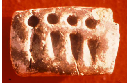
Figure 4. Tablet showing the impression of spheres and cones representing measures of grain, from Godin Tepe, Iran, ca. 3200 B.C.

frequency of delivery to the temple became regulated, and non-compliance was penalized. The response to the new challenge was the invention of envelopes where tokens representing a delinquent account could be kept safely until the debt was paid. The tokens standing for the amounts due were placed in hollow clay balls and, in order to show the content of the envelopes, the accountants created markings by impressing the tokens on the wet clay surface before enclosing them. (Fig. 3) The cones and spheres symbolizing the measures of grain became wedge-shaped and circular impressed signs. (Fig. 4) Within a century, about 3200 BC, the envelopes filled with counters and their corresponding signs were replaced by solid clay tablets which continued the system of signs impressed with tokens. By innovating a new way of keeping records of goods with signs, the envelopes created the bridge between tokens and writing.