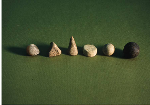
Figure 1. Plain tokens, Mesopotamia, present day Iraq, ca. 4000 B.C. The cone, spheres and disk represented various grain measures; the tetrahedron stood for a unit of labor.

features unearthed in the mounds in order to estimate the size and lay out of early settlements and find out whether the inhabitants were fully or semi-sedentary. Organic materials discarded in antiquity, such as bones and charred ears of grains, have been carefully studied because they disclose not only people's diet but the economy at a given site, namely, how much a community relied on hunting, fishing, farming or pastoralism. Other artifacts indicate the degree of technology reached by a society, whether tools and weapons were made by chipping stone or alloying and casting metals. Jewelry illustrates the fashions of yesteryear. For example, the excavations of the cemetery of Ur, in Mesopotamia, dating from about 2500 BC, showed that women of the Sumerian elite wore gold wreaths made in the shape of beech leaves. Lastly, figurines and divine representations suggest the beliefs and rituals of a society.