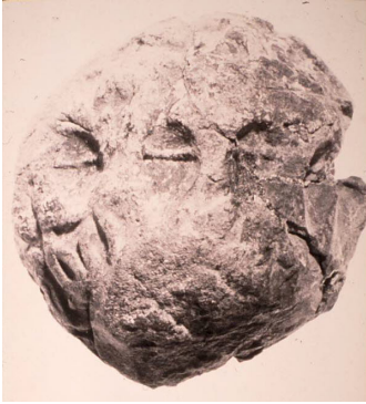
Figure 3. Envelope showing the imprint of three ovoid tokens with an incised line representing jars of oil, from Habuba Kabira, Syria, ca. 3300 B.C.