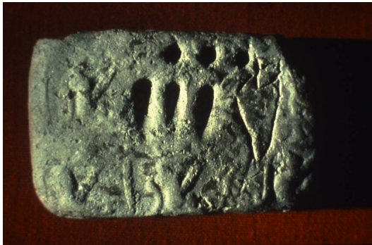
Figure 5. Pictographic tablet featuring an account of 33 measures of oil, (circular = 10, wedges = 1) from Godin Tepe, Iran, ca. 3100 B.C.

administer challenged writing to evolve in form, content and, as will be discussed later, in cognitive ability. First, about 3100 BC, the form of the signs changed when a pointed stylus was used to sketch more accurately the shape of the most intricate tokens and their particular markings. The sign for oil, for example, reproduced the ovoid token with its circular line at the maximum diameter (Fig. 5).