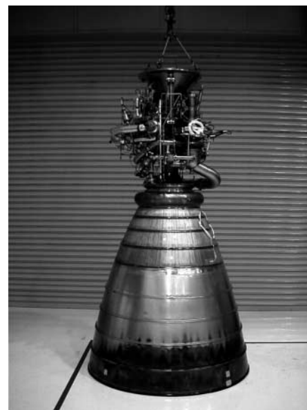
Fig. 2 LE-5B engine