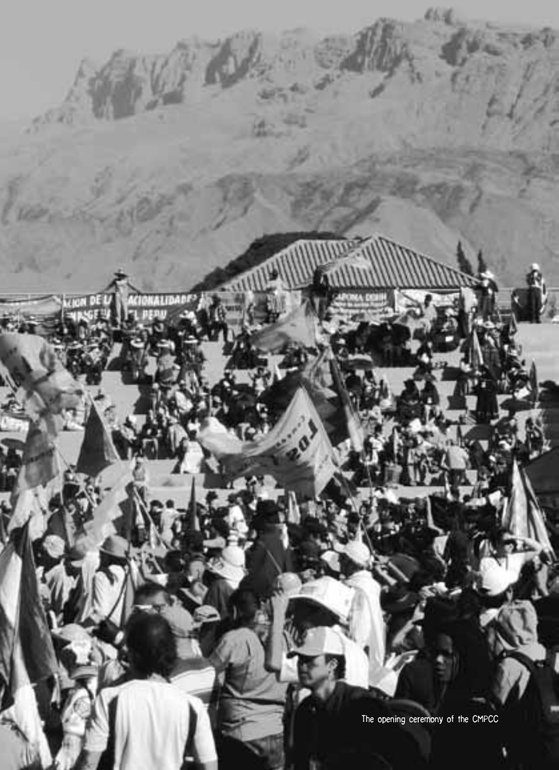
The opening ceremony of the CMPCC