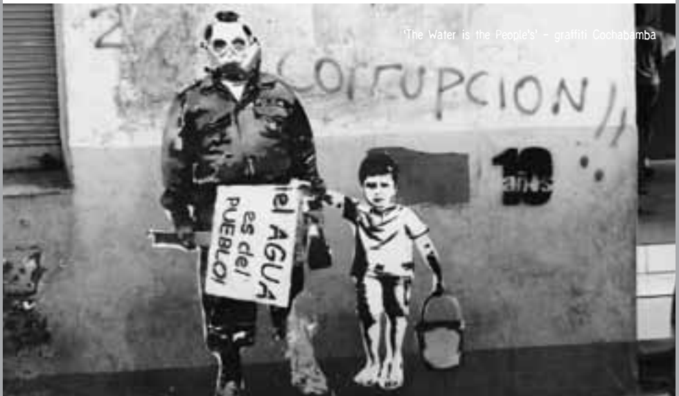
“The Water is the People’s! – graffiti Cochabamba

<20> Regantes are those that work in irrigation and are one of the bases of support for the Evo government. From the Spanish verb, regar = to water.