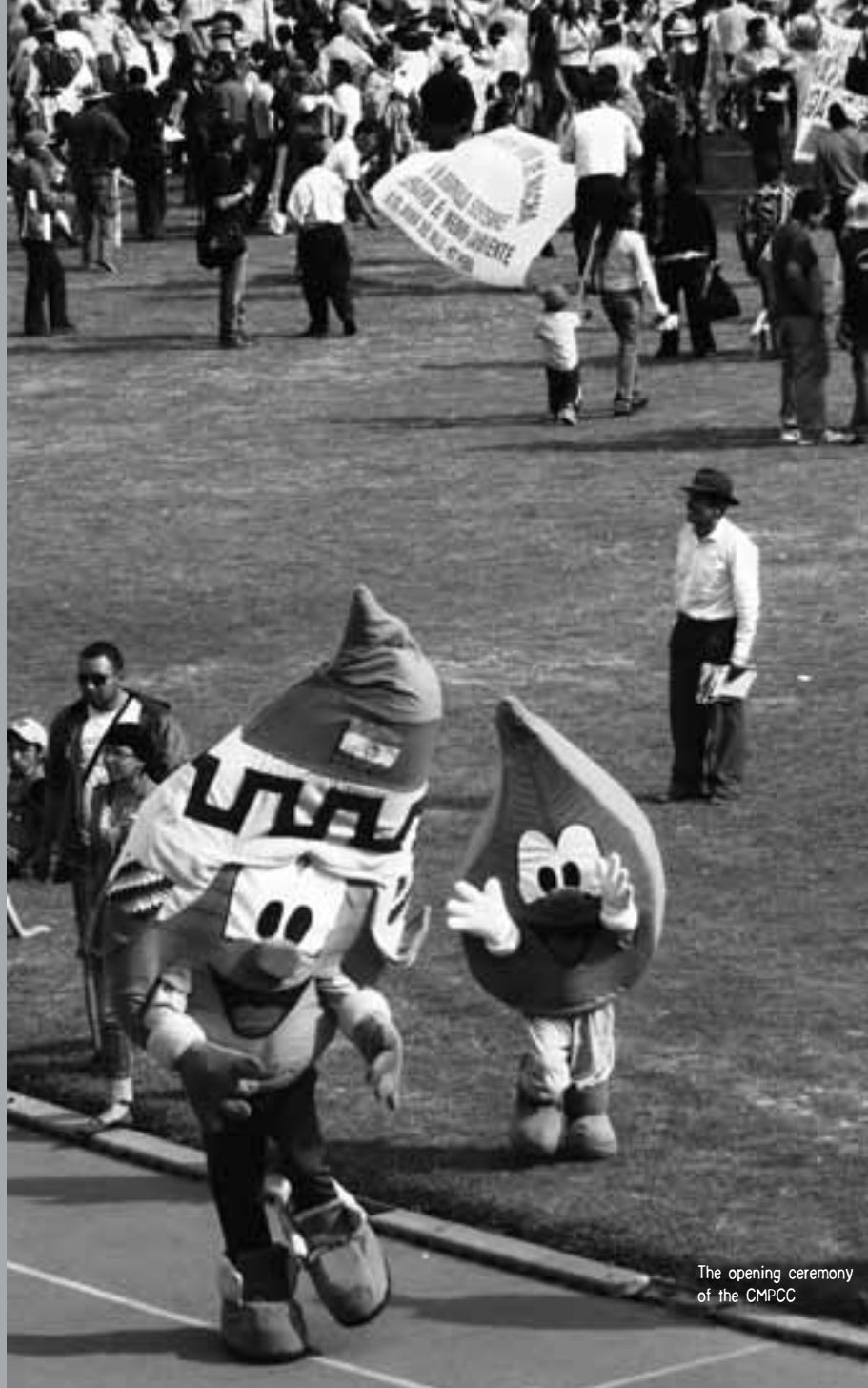
The opening ceremony of the CMPC