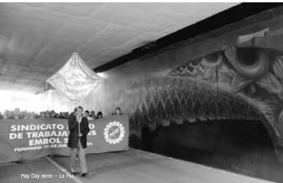
May Day demo – La Paz

One IIRSA project is the construction of the Inambari hydroelectric dam in the Peruvian Amazon. This will be the 5th largest dam in South America and most of the energy generated will be purchased by Brazil. This construction is expected to flood 45 thousand hectares of forests and to impact on the National Park Bahuaja Sonene, home of Indigenous communities and rich biodiversity. The Indigenous Federation of Madre de Dios is trying to resist this project warning that it will force entire communities to migrate. In March 2010 massive mobilizations made a 48 hour road block in Puno preventing any access to the city, the university was taken by students and the municipal office was attacked, with the central demand of stopping Inambari and releasing the imprisoned community leaders. Although construction is still ongoing, local resistance is continuing to delay the planned completion of the project.