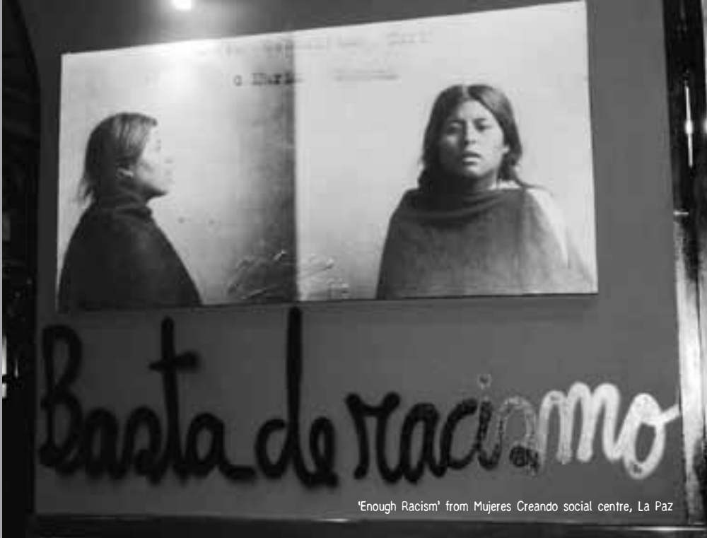
'Enough Racism' from Mujeres Creando social centre, La Paz

ties of colour in the US used the existing legal structures and the language of rights to successfully resist structural environmental racism and industrial dumping in their neighbourhoods.