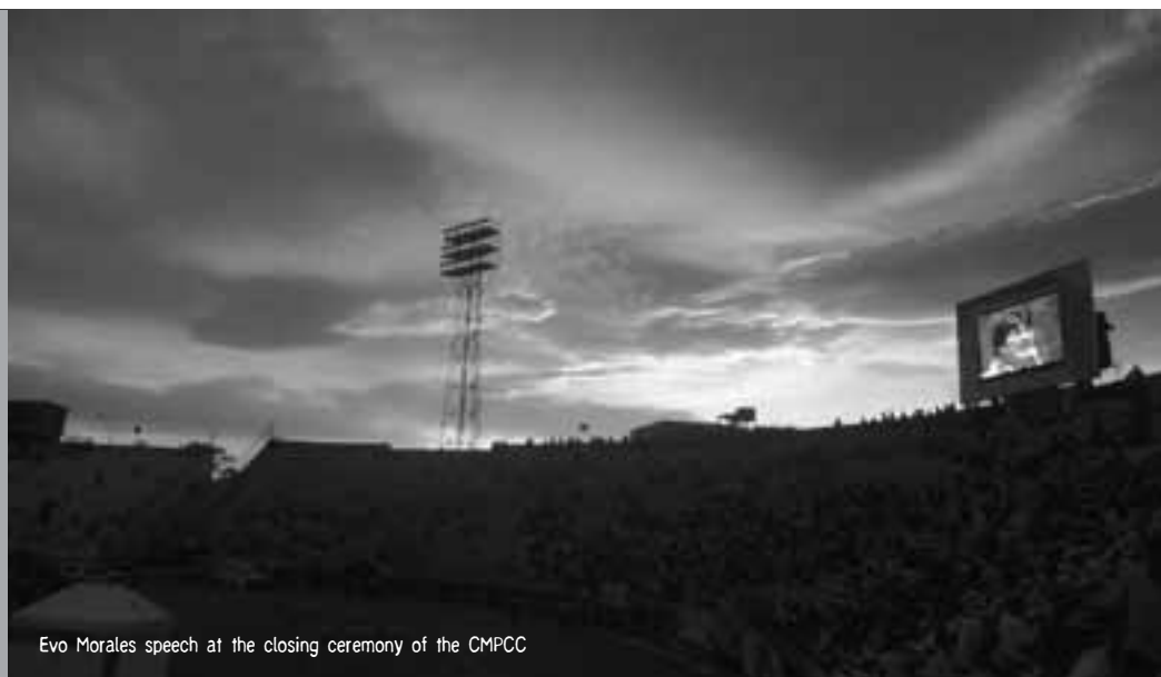
Evo Morales speech at the closing ceremony of the CMPCC