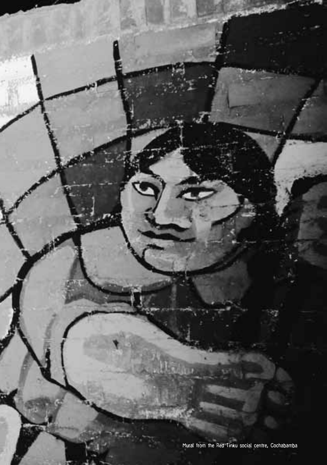
Mural from the Red Tinku social centre, Cochabamba