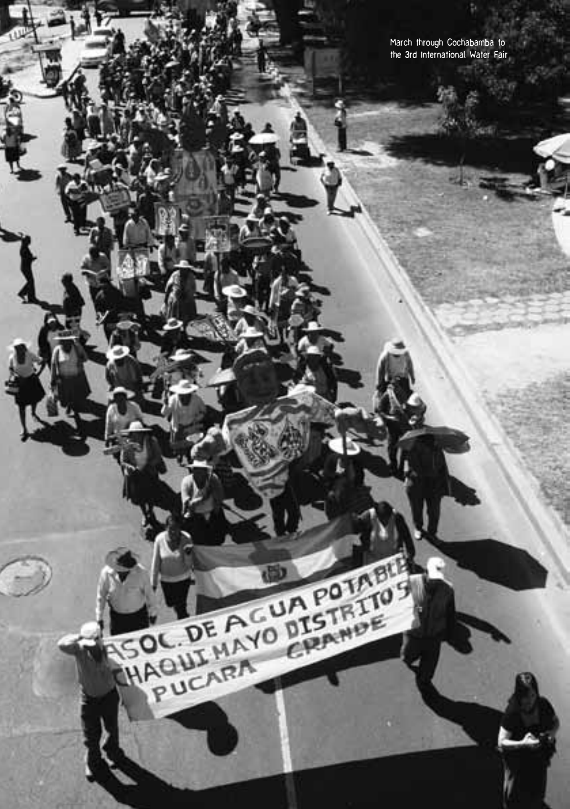
March through Cochabamba to the 3rd International Water Fair