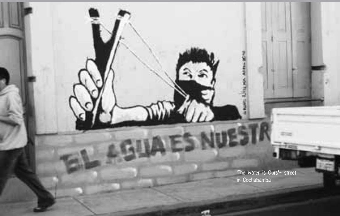
'The Water is Ours'- street in Cochabamba

Bolivia was a key part in this global movement of movements as expressed in the reflections from the 3rd PGA International Conference that began less than a week after September 11th, 2001: "The repressive new world order that the USA has justified by the attack in New York was immediately evident... After the attack, the Bolivian government practically sealed the border for PGA and the governor of the province declared to the press that the PGA delegates were all "potential terrorists" and had organised the riots in Europe and North America. The US ambassador publicly threatened Evo Morales, the leader of the Six Federations of the Tropics of Cochabamba, for having dared to simultaneously condemn the terrorist attack and the state terrorism practised by the USA in Iraq, Colombia, etc." This was perhaps influential in Bolivia's ability to mobilise for the CMPCC.