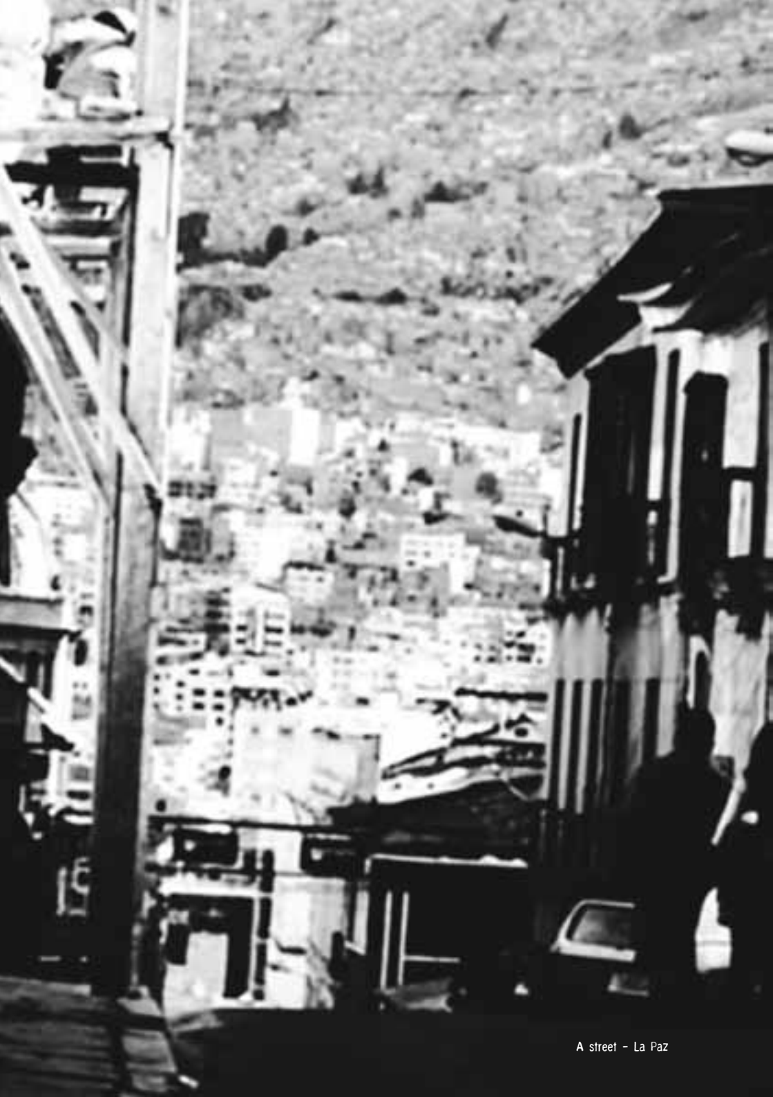
A street - La Paz