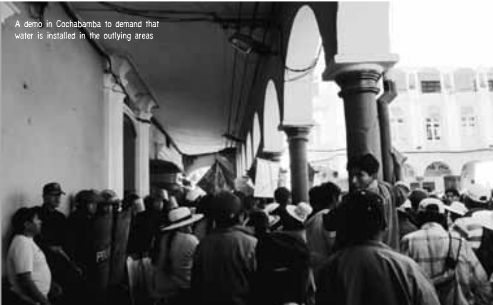
A demo in Cochabamba to demand that water is installed in the outlying areas

“In the Amazon, solidarity is more than a word; it is a feeling and a way of living. It is to know that you are not alone, that you are not irresponsible. It is not only about other people but about everything. The words solidarity and reciprocity also mean respecting and taking care of the environment. In our way of life there exists a strong interdependence that functions against individualism. The capitalist system, that does not work, wants us to be isolated and only think in individuals. Solidarity can break the structure of this system if we all work together, collaborate and unite. The answer therefore is in the idea of cooperation” (Fabricio Guáman).