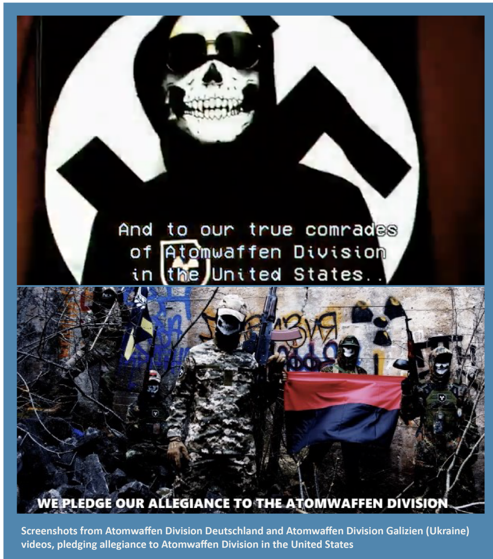
Figure 4: AWD Affiliate’s Pledge of Allegiance Videos

In fact, AWD has created several recruitment and propaganda videos that, apart from being notably well-produced, harken on symbolism and language used by Salafi-jihadist organizations, including ISIS. In October 2019, AWD posted a video titled “Fission” on an encrypted chat forum depicting a masked man who is wielding a knife and burning the U.S., EU, and Israeli flags – bearing a striking resemblance to ISIS videos featuring ‘Jihadi John.’ The masked man uses phrases like: ‘We will vanquish the modern world in totality...’ and ‘...join us, or perish with the rest!’ and proclaims that there will be no negotiations and no compromises, similar to the views al-Qaeda portrays in its video and audio messages to attract new recruits around the world.