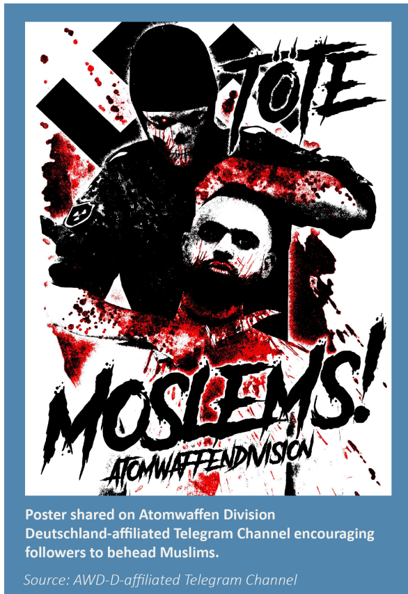
Figure 3: German-Language AWD Propaganda Poster

AWD-D should be analyzed within the context of a rising right-wing extremist threat in Germany, which German intelligence agencies have begun to monitor intensively. Thomas Haldewang, the president of Germany’s domestic intelligence agency, has called far-right extremism and terrorism the ‘biggest danger to German democracy today.’ 26 The rise of the German far-right, exemplified by the growing influence of the anti-immigrant Alternative for Germany party in the years since the peak of its migrant crisis in 2015, has provided fertile ground for extremist elements to flourish.