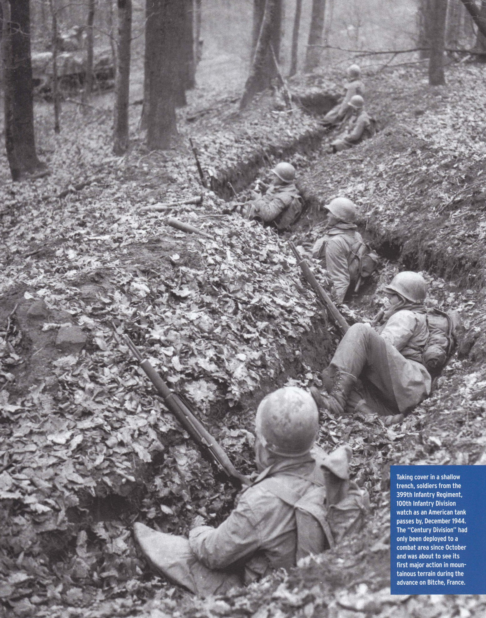
Taking cover in a shallow trench, soldiers from the 399th Infantry Regiment, 100th Infantry Division watch as an American tank passes by, December 1944. The "Century Division" had only been deployed to a combat area since October and was about to see its first major action in mountainous terrain during the advance on Bitche, France.