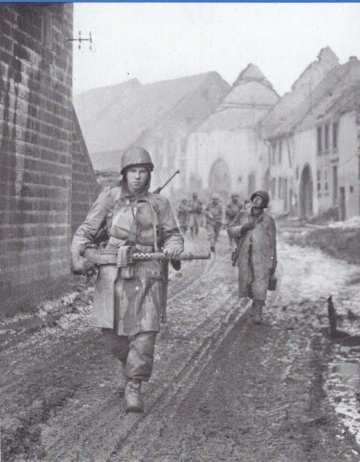
TABLE OF CONTENTS WWII QUARTERLY