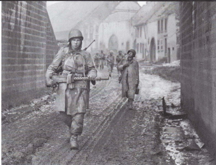
ABOVE: American infantrymen advance through a French village and beneath a railroad overpass west of Lemberg. The division took Lemberg on December 9, but only after heavy losses. BELOW: A damaged M4 Sherman of the 781st Tank Battalion, attached to the 100th Division, gets towed out of a ditch near Lemberg.

When F Company returned to its original positions on December 10, they found the bodies of some of their men lying side by side, all with bullet holes in their heads and their arms tied behind them. One of the executed was a close friend of Hal Bing-