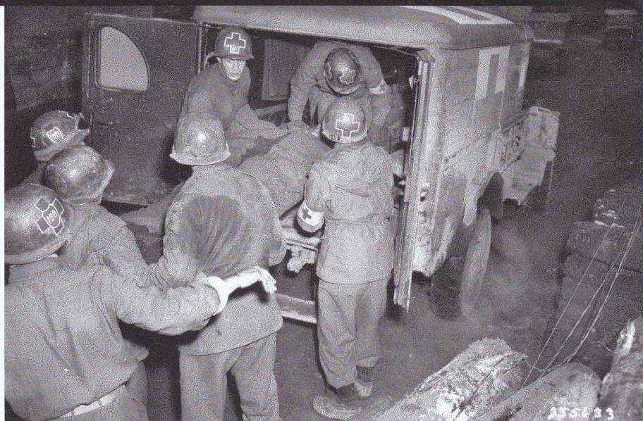
ABOVE: Medics load a 398th Regiment soldier, wounded during the drive on Bitche on December 14, 1944, into an ambulance. Many less seriously injured men refused to be evacuated. OPPOSITE: 105mm artillery pieces fire on German positions during the 100th Division's advance on Bitche.