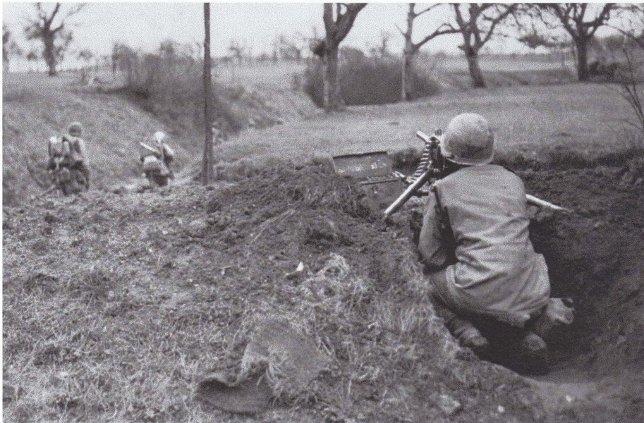
An American machine gunner provides covering fire as his comrades advance on Maginot Line fortifications held by the Germans.