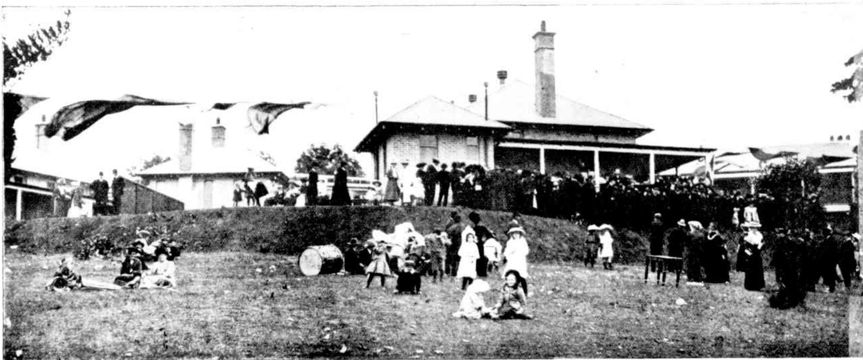
AT THE OPENING CEREMONY.