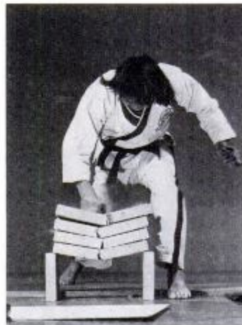
SEE PAGE 66