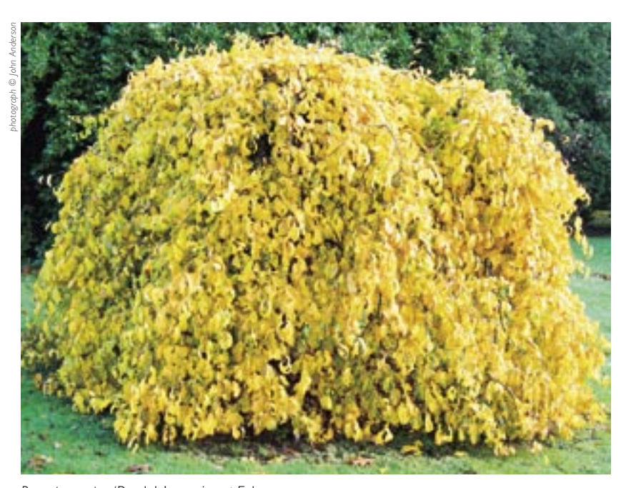
Parrotia persica 'Pendula' growing at Exbury.

Wijnands, O. (1995). Hamamelidaceae. In J. Cullen et al. (eds). The European Garden Flora. Vol. 4. pp. 166-170. Cambridge University Press, Cambridge.