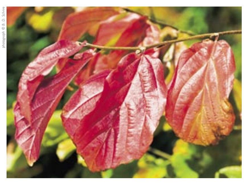
Above A close-up of Parrotia persica foliage at Beaufront Castle, Northumberland. Below Foliage of P. subaequalis at the Savill Garden.