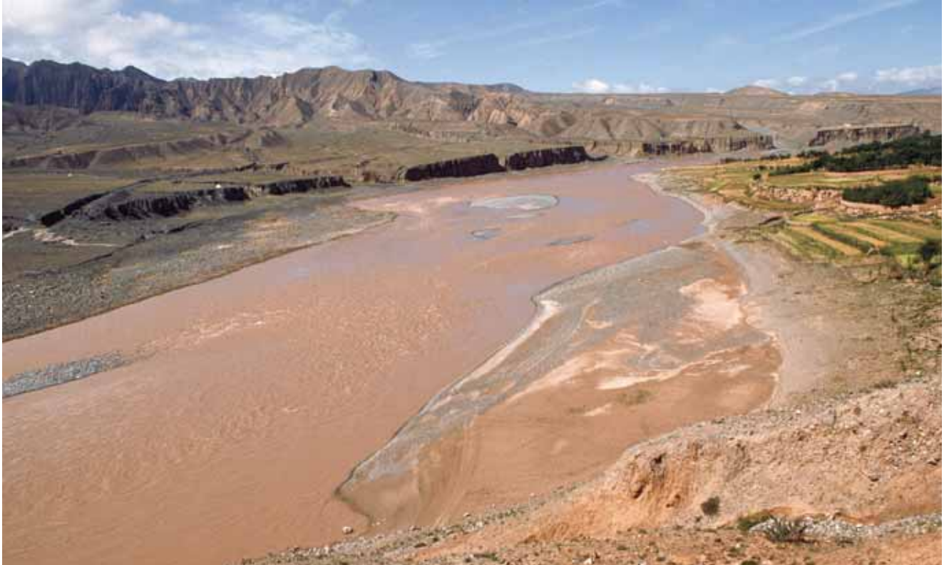
Figure 2 Yellow River on Qinghai Plateau, China.