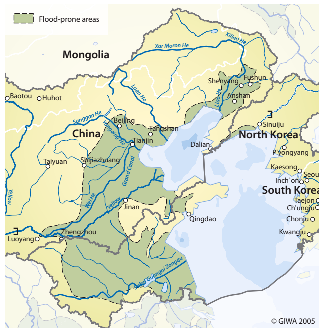
Figure 4 Flood prone areas along the main rivers in the Yellow Sea and Bohai Sea regions.

The main stream of the Hai River is only 70 km long with five tributaries confluent in the vicinity of Tianjin City, the industry centre of north China. Large amounts of floodwater from upstream along with inadequate discharge capacity in the middle and downstream sections often result in flood disasters. In 1963, an unusually big flood caused a catastrophe in this river basin. After that, a comprehensive flood-prevention programme was implemented by the Chinese government. Thus far, 140 large and medium-sized reservoirs have been built, with a total storage capacity of 25.3 billion m 3 , equal to 92.7% of the River's annual upstream run-off. At present the Haihe River system can withstand a once-in-a-50-year flood.