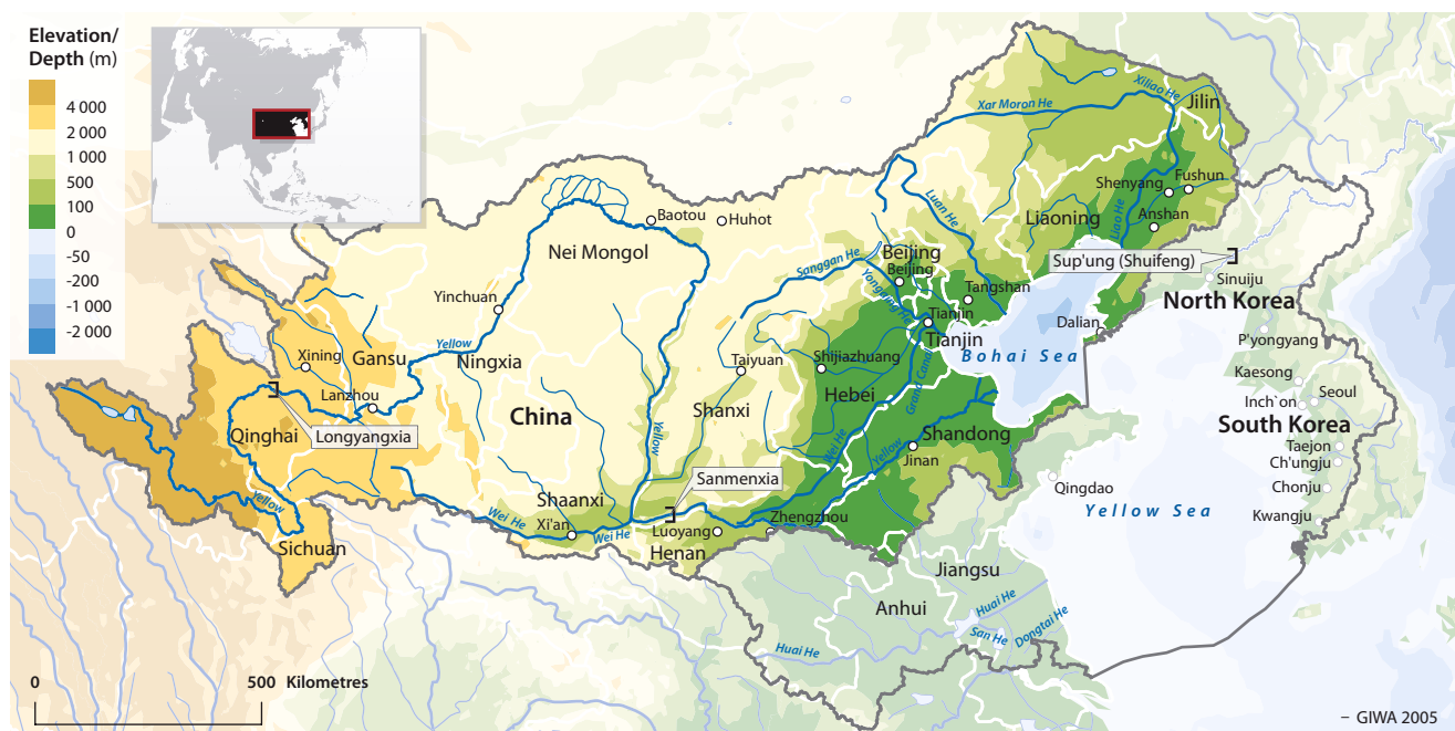
Figure 1 Boundaries of the Bohai Sea region.