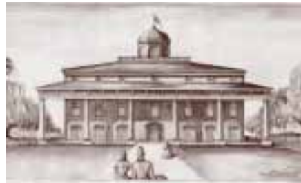
Donaldsonville Statehouse – 1830

During the 1800's, New Orleans was home to many of the early state houses. A theater, a convent, a hospital, and a hotel are just some of the places where the legislature met. Due to the interruption of war, shifts in political power, and fires in the state houses during this time the legislature continually debated where the government might be located.