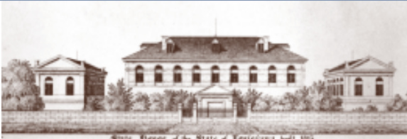
Charity Hospital – 1831

During the 1800's, New Orleans was home to many of the early state houses. A theater, a convent, a hospital, and a hotel are just some of the places where the legislature met. Due to the interruption of war, shifts in political power, and fires in the state houses during this time the legislature continually debated where the government might be located.