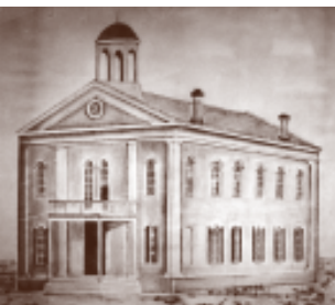
Shreveport Statehouse – 1863

Government square was the first building specifically designed for Louisiana's capital, but when legislators arrived in Donaldsonville for the 1830 session, they found the new state house woefully inadequate and in 1831 voted to move back to New Orleans.