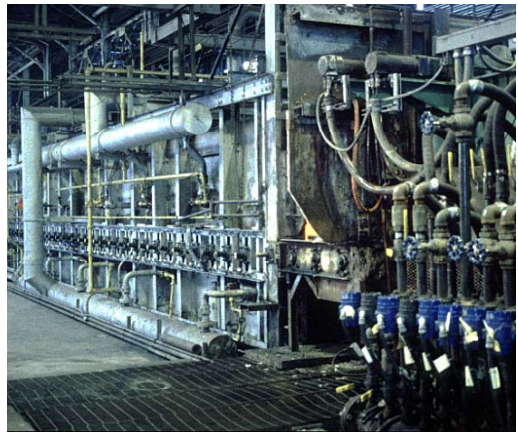
Conshohocken Q&T Line (used for thin plate)