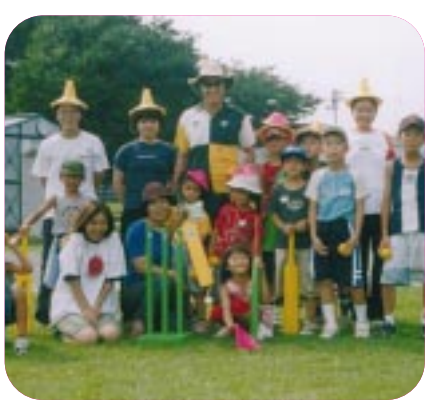
Young cricketers at a sportSpeaks clinic

The aim of the program is to have a Japanese team in the ICC EAP U-15 tournament in 2004 and to host international cricket gatherings in Gunma.