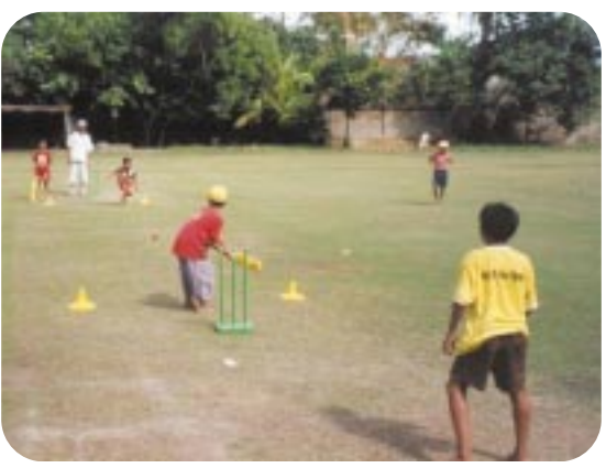
The award-winning 'Kanga' initiative in Indonesia