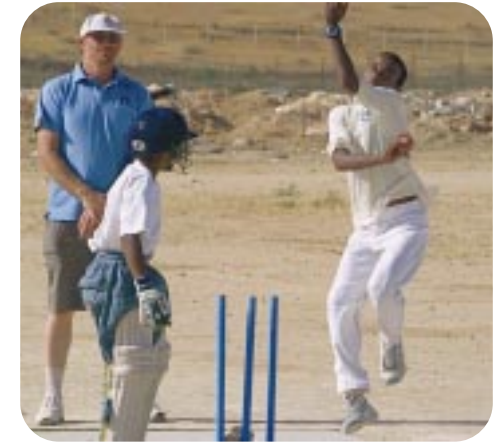
Junior cricket in Israe