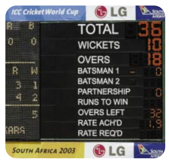
19th Feb, Paarl Sri Lanka bowls out Canada for a record-low 36 runs.