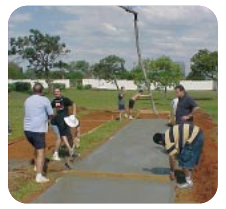
Foundations for future success

Interstate matches against Curitiba and Sao Paulo.