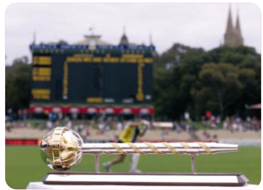
ICC Test Championship mace