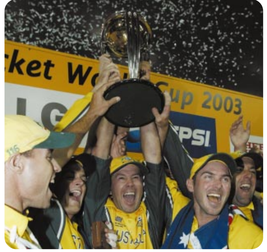
A record crowd of 32,827 for a cricket match in South Africa attended the ICC Cricket World Cup Final between the champions Australia and India at the Wanderers Stadium.