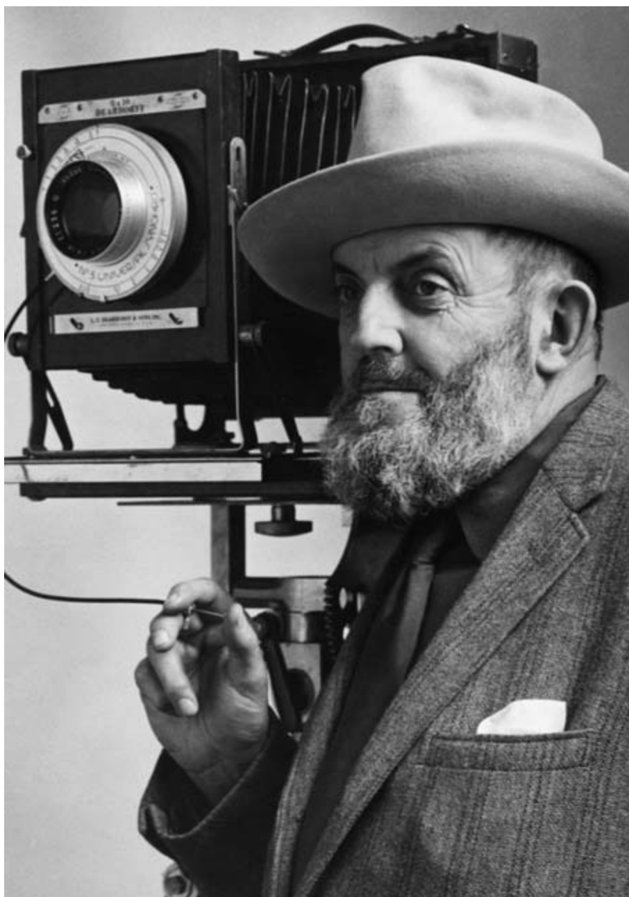
Ansel Adams, elected 1966