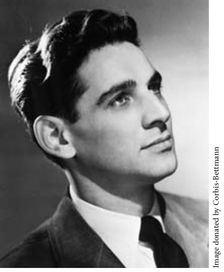
Leonard Bernstein, elected 1951