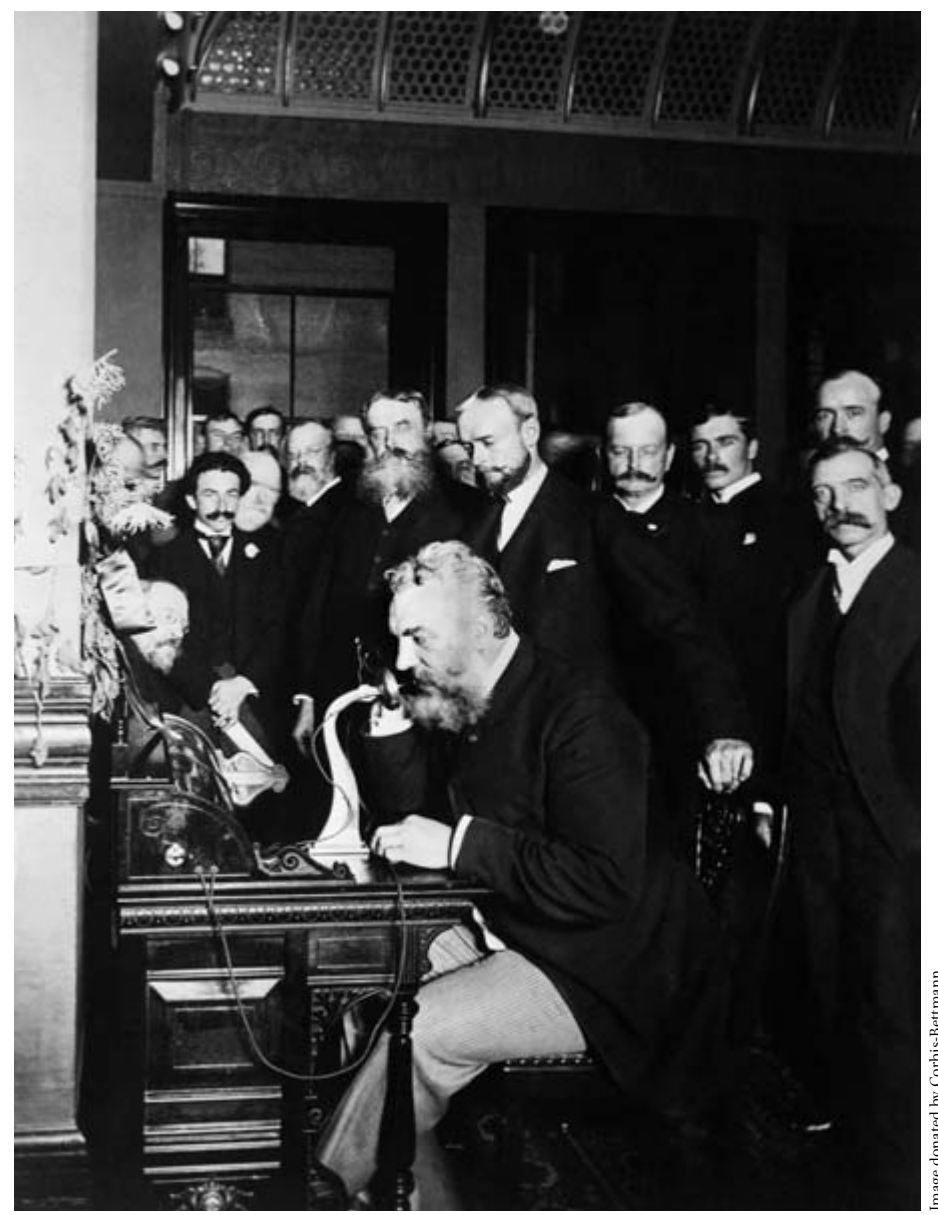
Alexander Graham Bell, elected 1877

Current affiliation: Microsoft Corporation