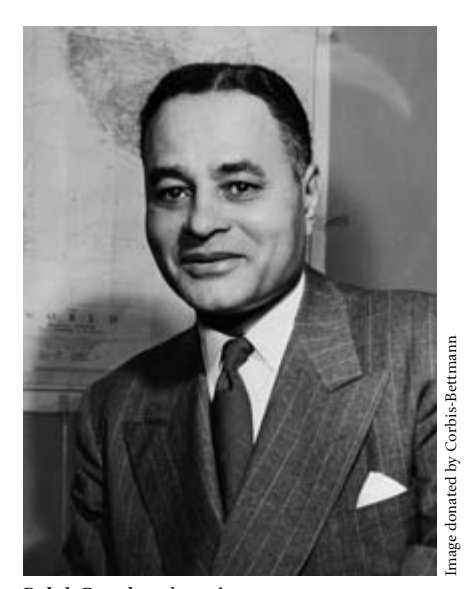
Ralph Bunche, elected 1951