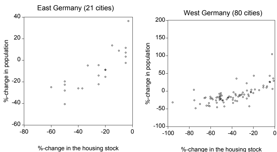
Figure 1 Housing stock destroyed and city-size growth in East and West German cities, 1939-1946