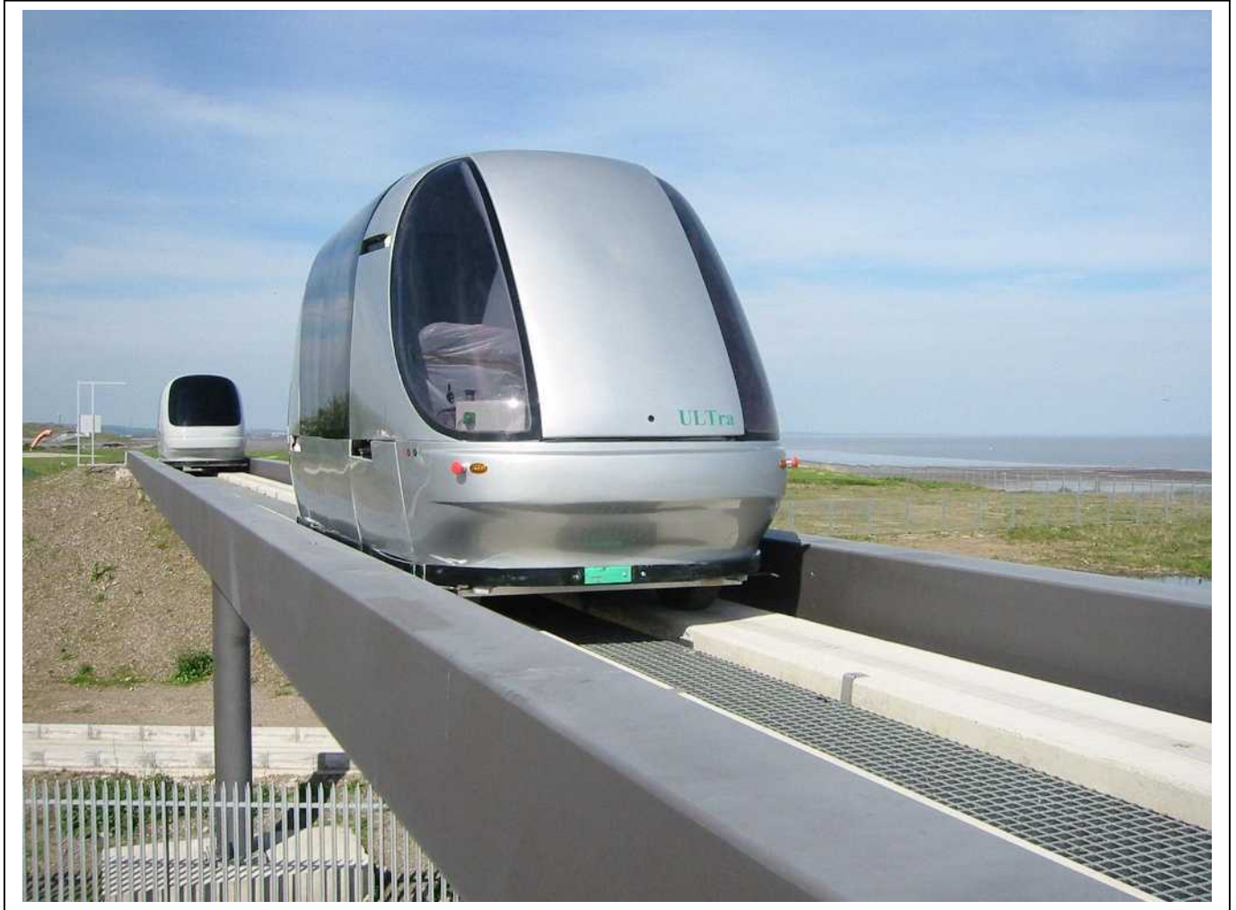
FIGURE 2 ULTra elevated guideway and T-Pods.