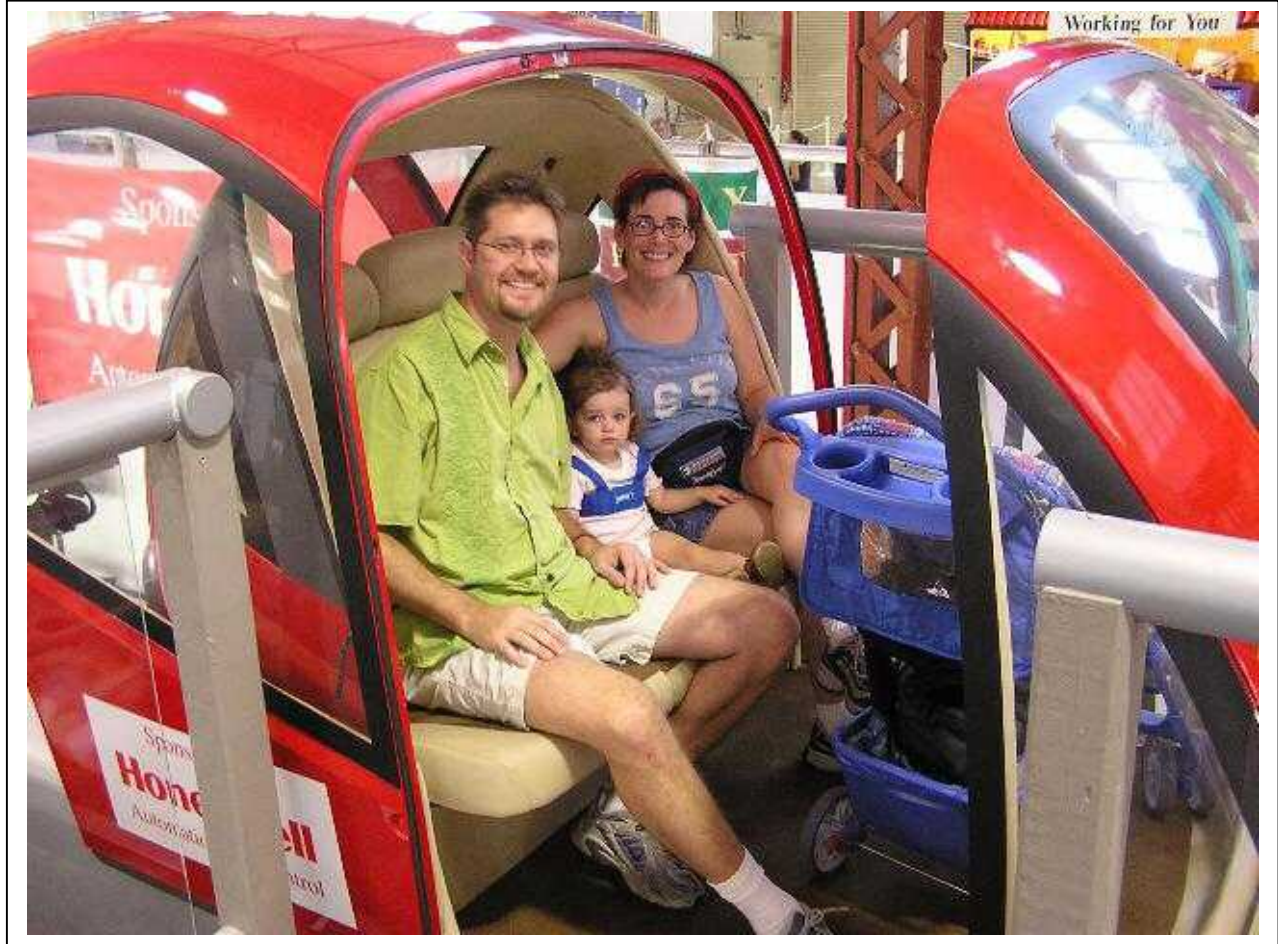
FIGURE 4 SkyWeb Express T-Pod.