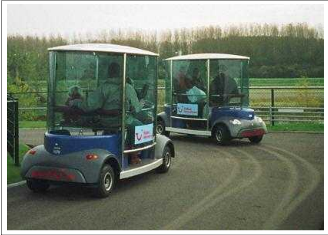
FIGURE 1 The 2getthere system. Note how the wheel tracks of numerous T-Pods verify the accuracy with which the guideway (defined by magnets under the surface) is followed.