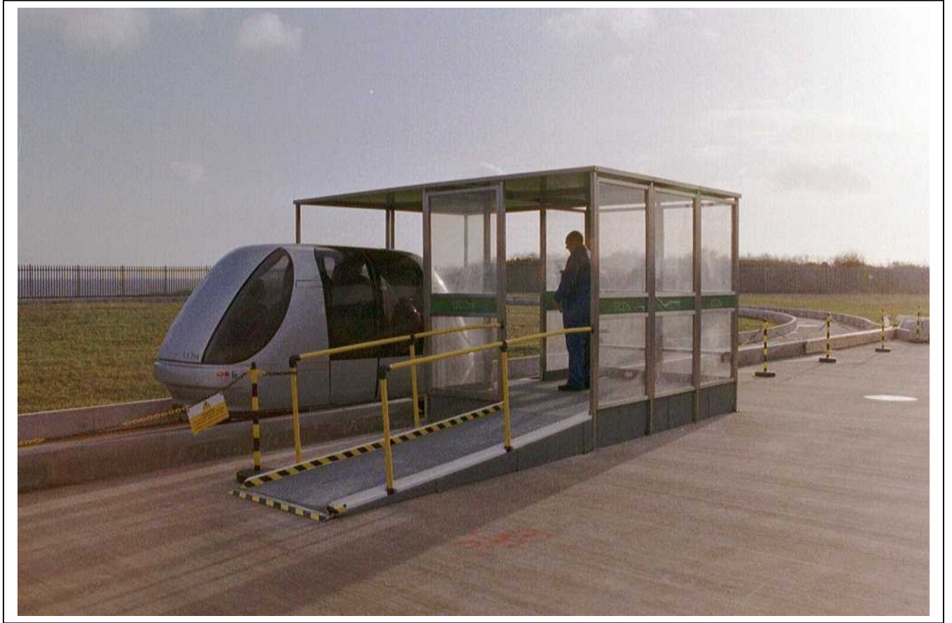
FIGURE 3 ULTra ADA-compliant station.