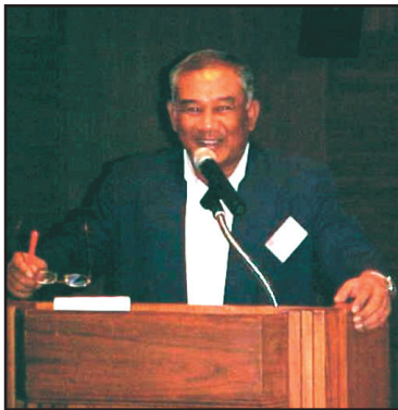
Colonel Roslun discussing Malaysian Armed Forces Roles in Disaster Response

The conference occurred during a period of heightened counterterrorist (CT) activity in Southeast Asia, with the international and local newspapers running daily front page articles on the renewed Jemaah Islamiyah (JI) Terrorist threat and government CT responses. Thailand was particularly involved, conducting raids of suspected JI cells in the south, and intercepting 30 kilograms (66 pounds) of the highly radioactive Cesium-137 (the critical constituent of a possible "Dirty Bomb") in Bangkok.