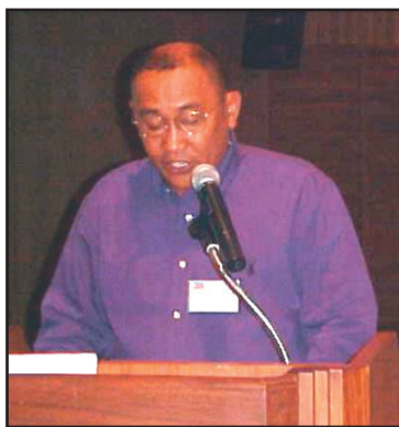
Armed Forces of the Philippines Brigadier General Santiago R. Casauay Jr. briefs results of Workshop

Conference presenters identified many issues of environmental degradation, health risks, and reduced economic capacity in minority and frontier areas, such as over logging—often illegal—of mountainous, slide-prone terrain on the Philippine Island of Mindanao. Several countries, Thailand and the Philippines in particular, have recognized the importance of addressing these root causes of terrorism with the military element of power. The curbing of illegal logging, disaster response planning, disease vector and erosion control, and developmental activities are areas of military support to civil authority that assure those segments of the population with ethnic, religious, or economic grievances that the state government cares for their economic welfare and health. Moreover, the military has a major role in protecting critical infrastructure such as dams, power plants, and water supplies and conducting consequence management operations for terrorist attacks.