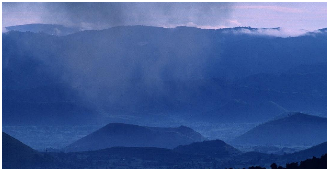
Juan Pablo Morales / FFI

Development of conservation support in the lowveld of southern Zimbabwe