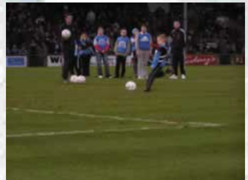
PFS Penalty Fun v Scunny Bunny