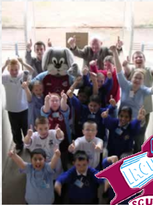
Bunny & PFS Friends