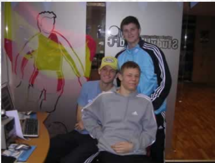
Members of the Youth team on the BTEC Programme.

The children interviewed the Youth team and made a video which the players then put in their portfolio for their BTEC National Diploma in Sports science.