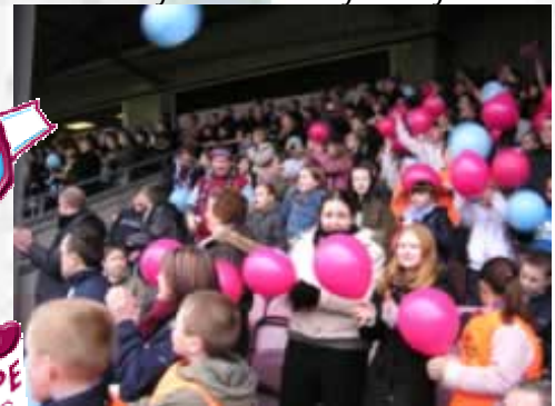
PFS students at a game (2-1 to SUFC!)