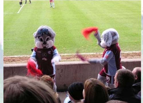
The Mascots entertain the PFS Students

The Scunny Bunny has made numerous appearances at PFS sessions. He has even stepped in to cover bus driving duties. His new partner the Scunny Honey Bunny made her first public appearance at a Study United session. She is also one of our enthusiastic mentors, who is considering a career change from tourism to education after enjoying her time with the children at the centre. The duo also staged a penalty shootout for 16 lucky children from the Study United Spring cohort.