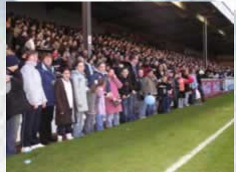
PFS Students on the pitch at half time.

The ground staff are always keen to help. They have been interviewed for our local newspaper by Study United students. They facilitate ground tours which couldn't go ahead without their cooperation.