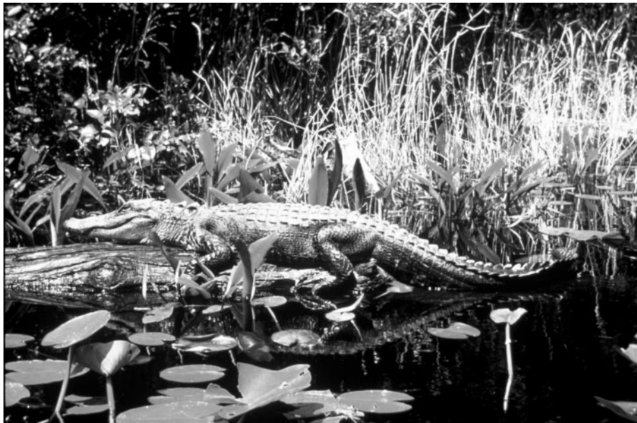
Figure 2. Alligator mississippiensis

Reports of alligator bites from previous surveys 9,10 were also evaluated for additional cases of bites or attacks that current state officials may not be aware of, for different personnel may currently be responsible for alligator complaints.