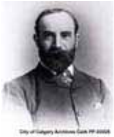
Cash PP-03025

City of Calgary Alderman, 1925 January 2 - 1930 December 31