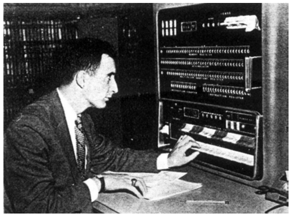
Figure 4: Operating the computer

The 701 could perform 33 distinct operations: addition, subtraction, multiplication, division, shifting, transfers, etc. – all coded in 'assembly language'. Multiplication was performed at 2,000 per second. It consisted of two types of storage. Electrostatic (high-speed) storage was in the form of banks (units) of cathode ray tubes; each unit could accommodate up to 2048 "full words", where a "full word" comprised 35 bits (binary digits) and one sign bit – 36 bits in all. Each full word could be split (stored) as two "half words", each of 17 bits and one sign bit. Although the 701 had two electrostatic units, only one was used in the MT experiment. Average access time was 12 microseconds. The second type of storage (with lower access speed, 40 milliseconds) was a magnetic drum unit comprising four 'addressable' drums, each accommodating up to 2048 "full words". The magnetic drum was used to store dictionary information; the reading and writing (input and output) rate was 800 words per second.