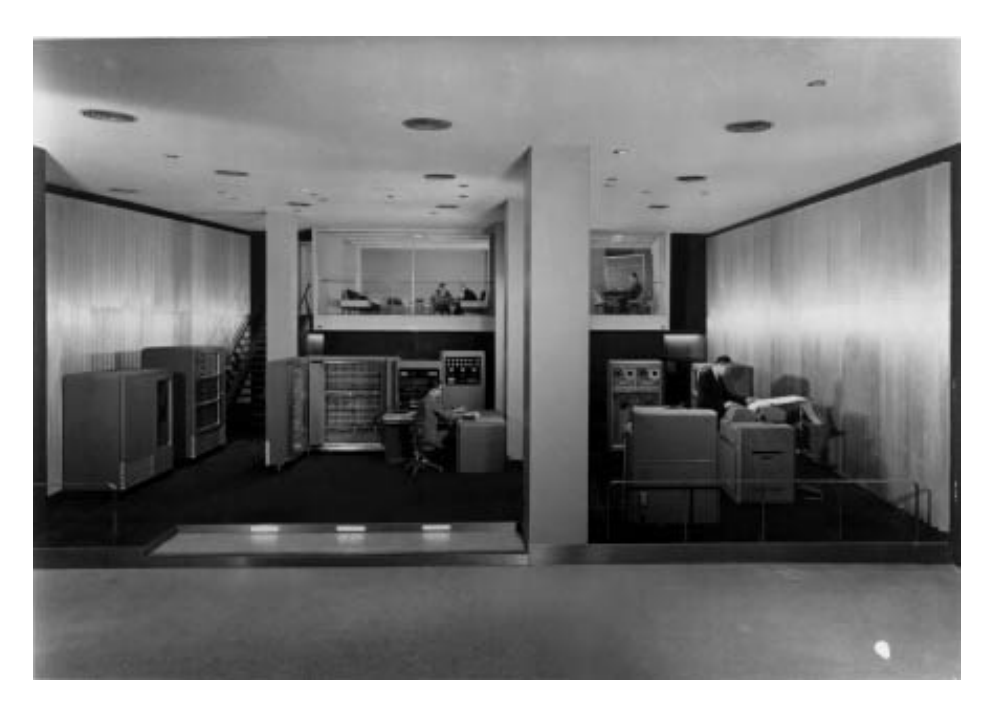
Figure 3: the 701 at IBM's New York headquarters

The 701 could perform 33 distinct operations: addition, subtraction, multiplication, division, shifting, transfers, etc. – all coded in 'assembly language'. Multiplication was performed at 2,000 per second. It consisted of two types of storage. Electrostatic (high-speed) storage was in the form of banks (units) of cathode ray tubes; each unit could accommodate up to 2048 "full words", where a "full word" comprised 35 bits (binary digits) and one sign bit – 36 bits in all. Each full word could be split (stored) as two "half words", each of 17 bits and one sign bit. Although the 701 had two electrostatic units, only one was used in the MT experiment. Average access time was 12 microseconds. The second type of storage (with lower access speed, 40 milliseconds) was a magnetic drum unit comprising four 'addressable' drums, each accommodating up to 2048 "full words". The magnetic drum was used to store dictionary information; the reading and writing (input and output) rate was 800 words per second.