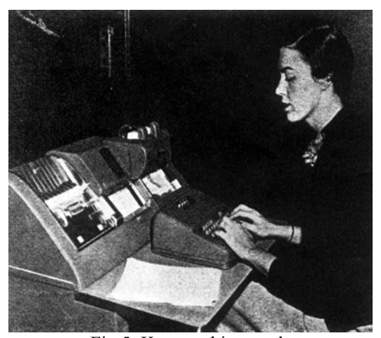
Fig.5: Keypunching cards

where the numbers refer to actual addresses in the drum (in octal).