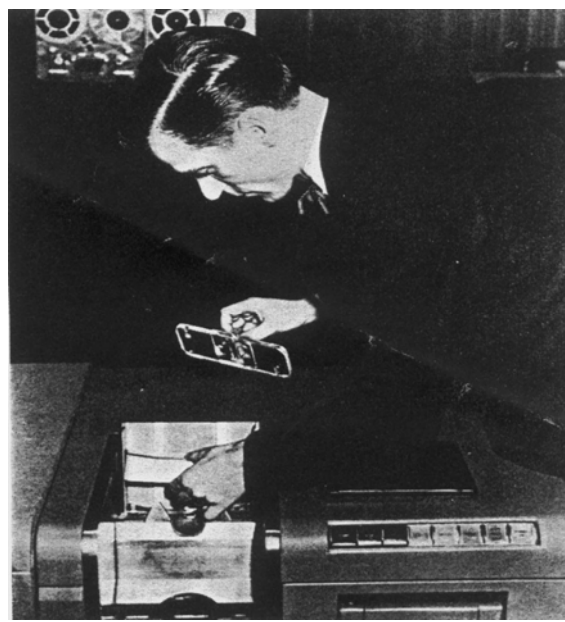
Fig. 6: Input of punched cards