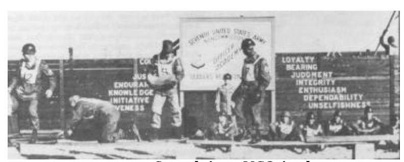
Seventh Army NCO Academy