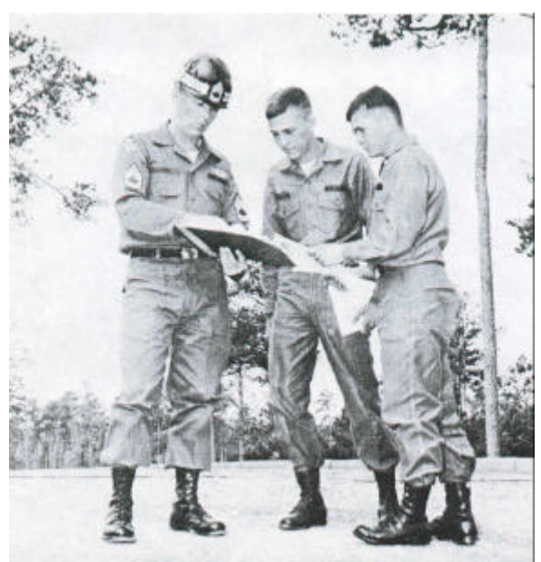
A TAC NCO critiques candidates

training. Young draftees attending initial training at the time knew they were destined for Vietnam. Many potential candidates were eligible for Officer Candidate School, but rejected it because they would incur an additional service obligation. They realized that NCOCC was a method by which they could expand on their military training before entering the war. Some were exposed to the Phase II NCO Candidates serving as TAC NCOs during their initial training and felt they could do the same. Many graduates would later say that the NCO Candidate Course, taught by Vietnam veterans who experienced the war first hand, was what kept them and their soldiers alive and its lessons would go on to serve them well later in life.