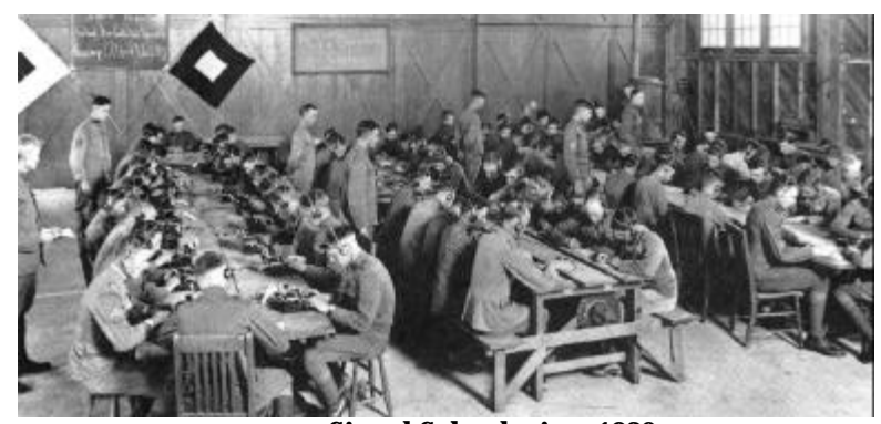
Signal School, circa 1920

at Fort Totten, New York and the Army Medical School were also established in the mid to late 1800's. Most of the educating was conducted indoors, except for the less technical courses, such as infantry and cavalry.