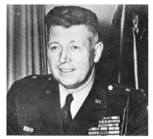
Brig. Gen. Bruce C. Clarke

Some of the difficulties facing the Army of 1971 included Westmoreland's concern for leadership