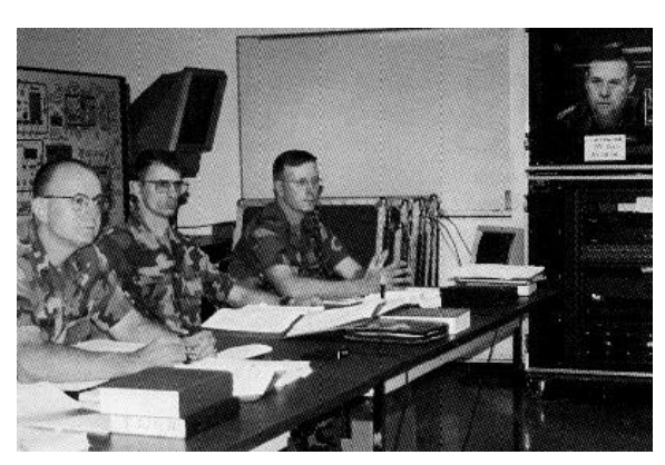
49th AD ANCOC via distance learning

Todd A. Weiler, the Deputy Assistant Secretary of the Army for Reserve Affairs, Mobilization, Readiness and Training, who had been instrumental in the development of the Army Distance Learning Program strongly emphasized that distance learning is a must and that the future of the Army must must involve distance learning. Computer based CD-ROM courses tied to a workstation now assist the student