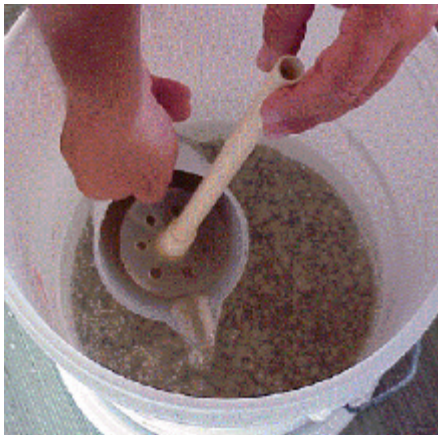
Larvae poured into buckets to attach to substrate