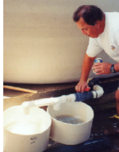
Putting saltwater through a 225 micron sieve to filter out larvae to be used in remote setting

Remote setting is the process in which larvae are set in a location away from the hatchery to make seed (reproduce). This process starts before the larvae set. Pediveliger larvae are collected on a 225-micron screen to produce single oysters. Next, larvae are wrapped in paper toweling and kept moist and cool. Larval oysters can then be shipped express overnight to an oysterfarmer for use in business. This process allows the hatcheries to specialize in larval growth and the oysterfarmer to specialize in oyster growth, improving production volume, and decreasing cost of production. This division of labor between hatchery and nursery grow-out makes the oyster business economically feasible.