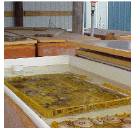
Holding tanks of oysters to be spawned

and marked either male or female. Oysters in water that is 24°C take about four weeks to go from a non-reproducible “unripe” state to a reproducible, or “ripe”, state to spawn (or release eggs or sperm).