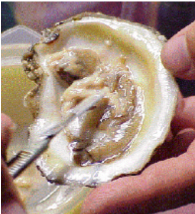
Scraping eggs from gonads

(Students may want to see "Oyster Anatomy" activity for more information on this.)