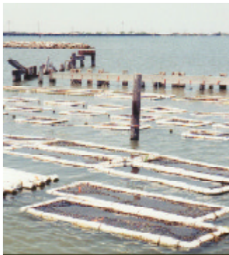
Rafts for oyster farming

The oyster producer puts seed oysters into appropriately sized mesh bags. The bags are then placed in racks, rafts, lines, nets, or any other off-bottom system designed for oyster culture. Off-bottom culture allows the oyster to grow to market size (3") in twelve months in the gulf region, instead of two years when grown on-bottom.