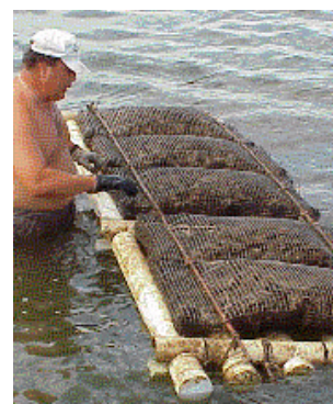
Close-up view of growing oysters