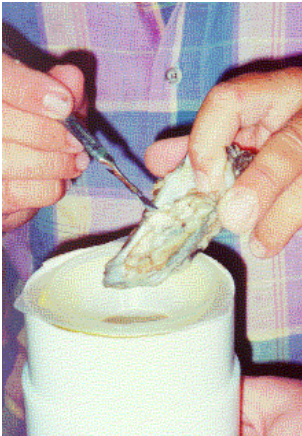
Scraping eggs from gonads

The spawning stage begins after the oyster's gonads develop when the water temperature is raised to mimic springtime. Once "ripe," oysters can then be placed into a holding tank until they are needed. When an order for oyster larvae arrives at the hatchery, ripe oysters are then available for use. After the initial spawning, oysters in the gulf region can spawn again approximately every four weeks from April through October.